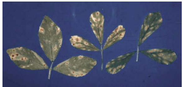
Figure 4. Lepto , or pepper leaf spot.

STEMPHYLIUM, OR ZONATE LEAF SPOT is caused by the fungus Stemphylium botryosum ; sexual stage Pleospora herbarum . Stemphylium leaf spot is a common disease that develops during prolonged periods of warm, wet weather in the summer and fall, especially in dense stands. Small, oval, dark brown spots appear on the leaves, petioles, stems, peduncles, and seed pods. The slightly sunken spots later enlarge and often become zoned. They are light and dark brown, often surrounded by a pale yellow “halo” (Figure 5). Infected leaves