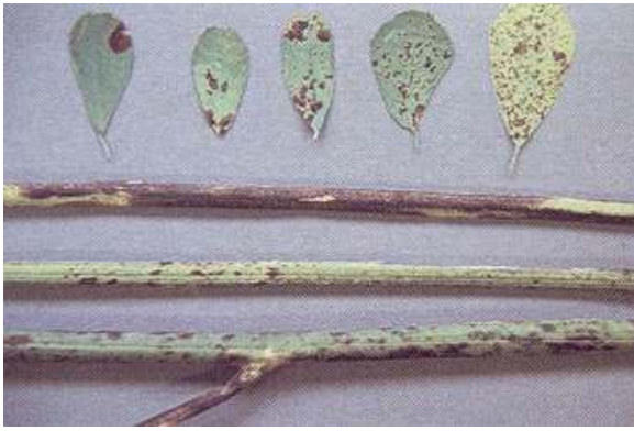
Figure 2. Spring black stem.

before dropping off. Stem and petiole lesions may enlarge, girdle, and blacken large areas near the base of the plant (Figure 2). The fungus may extend into the crown and upper root causing a crown and root rot. Affected stems are brittle and easily broken. When severe, entire stems are blackened and killed.