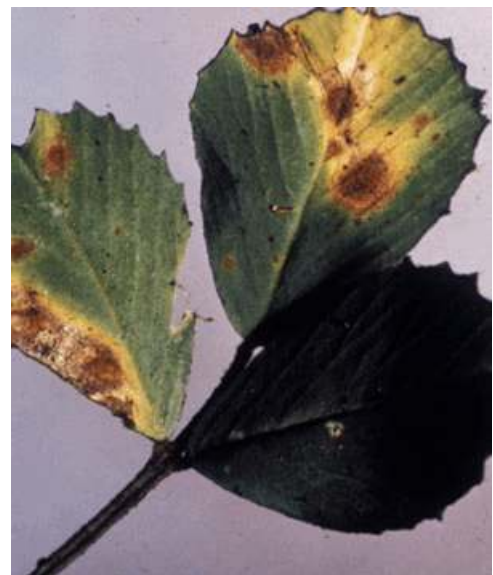
Figure 3. Yellow leaf blotch. Note the dark areas (pseudostromata and apothecia) on the infected leaflet.

YELLOW LEAF BLOTCH is caused by the fungus Leptotrochila medicaginis (formerly named Pseudopeziza or Pyrenopeziza medicaginis ); imperfect stage Sporonema phacidiodes . It occurs primarily in the northern half of the United States and in Canada. Yellow leaf blotch is less prevalent than common leaf spot or spring and summer black stem, being most conspicuous in rank and unusually tall stands. Disease attacks occur during prolonged cool, wet weather in the spring and autumn. Enlarging yellow spots, streaks, and blotches develop, most commonly along the leaf margins or along the veins. The blotches become elongated to fan-shaped as they expand and orange-yellow with small dark dots, which are fungus fruiting bodies (pycnidia), embedded in the center. The center of