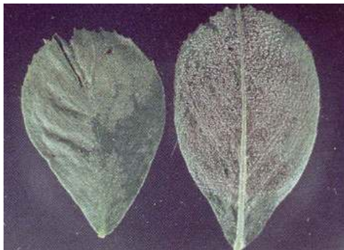
Figure 7. Downy mildew on two alfalfa leaves. Note the downy mold growth on the underside of the leaf (right).

DOWNY MILDEW is caused by the fungus Peronospora trifoliorum . Downy mildew may be prevalent during uncommonly cool, wet or very humid late springs. The disease seldom damages stands. Downy mildew is most severe during the first year following seeding. Mildew disappears during warm, dry weather but may reappear during cool, wet periods in the autumn. Pale green to yellowish green blotches appear on the young leaves. If the disease is severe, leaflets will roll and twist downward. A delicate, violet-gray, downy mold of conidiophores and conidia may be abundant on the underside of