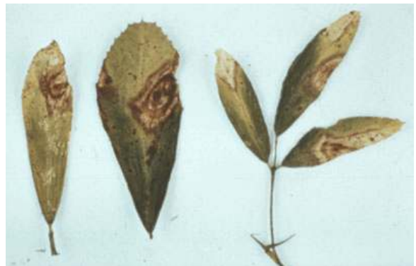
Figure 5. Stemphylium leaf spot.

STEMPHYLIUM, OR ZONATE LEAF SPOT is caused by the fungus Stemphylium botryosum ; sexual stage Pleospora herbarum . Stemphylium leaf spot is a common disease that develops during prolonged periods of warm, wet weather in the summer and fall, especially in dense stands. Small, oval, dark brown spots appear on the leaves, petioles, stems, peduncles, and seed pods. The slightly sunken spots later enlarge and often become zoned. They are light and dark brown, often surrounded by a pale yellow “halo” (Figure 5). Infected leaves