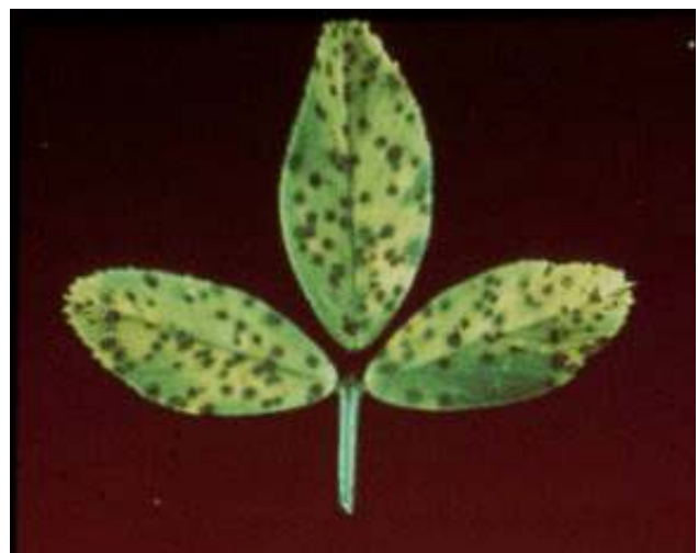
Figure 1. Common or Pseudopeziza leaf spot.

Small, circular, dark brown to black spots, about 1/16 inch (1 to 3 mm) in diameter, develop first on the lower and inner leaves (Figure 1). In the thickened center of fully developed spots, a tiny, raised, light brown, disk-shaped fungus fruiting body (apothecium) forms on the upper leaf surface. This fruiting body is easily visible with a hand lens or reading glass. Large numbers of microscopic spores (ascospores) are shot into the air during cool to warm, wet weather and are carried by wind currents and rainsplash to other plants. Thus, the disease may spread quickly throughout a field. When the spots are numerous, the leaflets soon turn yellow and fall off. Premature defoliation reduces the quality and quantity of forage. The causal fungus overwinters as mycelium in fallen, undecayed leaves and leaf fragments on the soil surface. It is not known to be seedborne. As indicated, disease attacks are most damaging on susceptible varieties during prolonged periods of cool, wet weather in spring, early summer, and autumn. The incidence of disease decreases during dry warm summers.