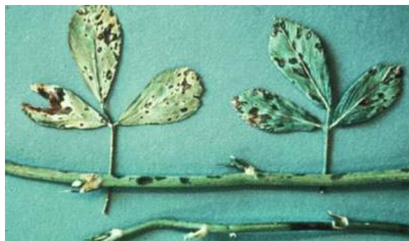
Figure 6. Bacterial leaf spot with stem lesions.

BACTERIAL LEAF SPOT is caused by the bacterium Xanthomonas campestris subsp. alfalfae ( X. alfalfae ). Bacterial leaf spot begins as small, irregular, yellowish, watersoaked spots on the leaves. These spots enlarge, turn brown to black, and may develop a light yellow to tan, papery center (Figure 6). The lesions usually shine due to dried, bacterial exudate. Severe defoliation is common. The stem lesions are watersoaked and “greasy” at first, later turning light to dark brown or black. Lesions may coalesce and extend for several inches. Seedlings are often killed, especially in late summer or early fall seedlings. The disease is favored by extended periods of hot, rainy, windy weather. Optimum growth of the bacterium occurs at 82° to 90°F (27° to 32°C). The casual bacterium overwinters in crop debris and seed. It is spread by wind and rain, insects, all types of equipment, and by infected forage. An invasion of alfalfa tissue occurs through a variety of wounds, especially those made by blowing sand or soil particles.