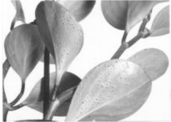
Figure 2. Oedema of Peperomia obtusifolia (nonvariegated) shown on the lower leaf surface.