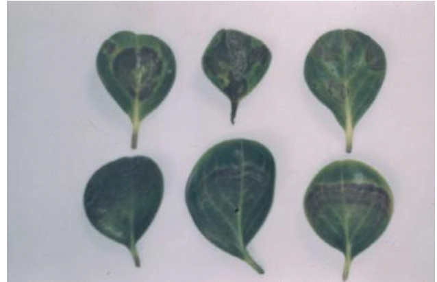
Figure 1. Ring spot of peperomia. Note the concentric, sunken dead areas.

Peperomia ring spot is caused by a virus that is commonly transmitted by taking cuttings from apparently healthy but infected plants. The disease affects Peperomia obtusifolia and P. obtusifolia var. variegata .