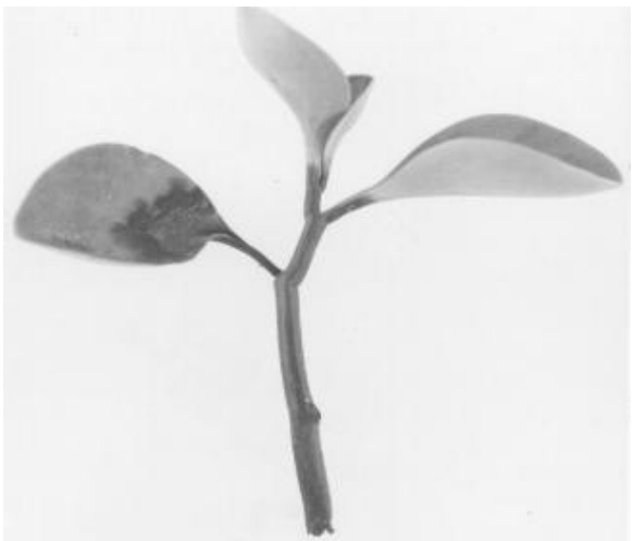
Figure 4. Cutting rot of peperomia. Note the blackened stem, petiole and base of leaves affected by Phytophthora.