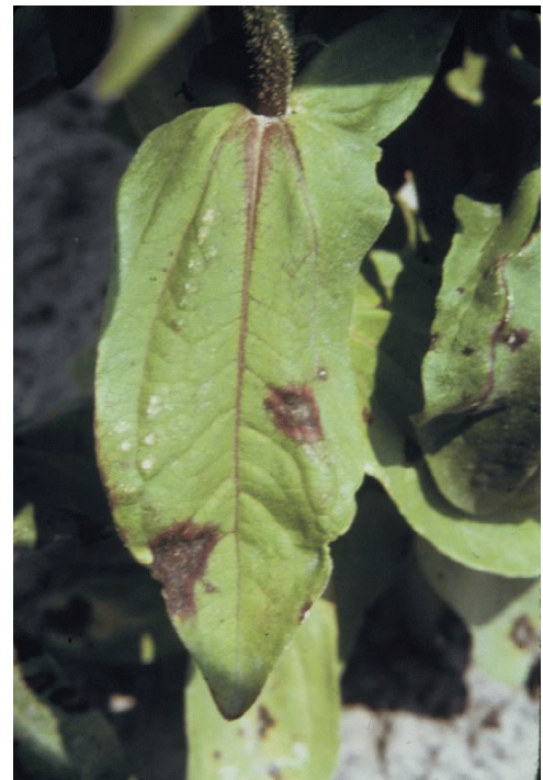
Figure 1. Alternaria leaf spot or blight.

Small, round, reddish brown spots with white to grayish white centers form on the upper leaf surface. Later, the lesions become fairly large (up to 10 mm in diameter), irregular, dark reddish brown or purple, and dry (Figure 1). The center of an older spot may drop out leaving a ragged hole. Heavily infected leaves turn brown and dry. The dead tissue has a tendency to crack and tear during wind and rain storms. Similar spots form on the petioles and on the stems at or between the nodes. The lesions may girdle the stem, often at a node, causing the upper portion of the plant to wilt and die back. Dark brown to black cankers with sunken centers are common near the soil line. Affected plants often wilt even when the basal cankers do not completely encircle the stem.