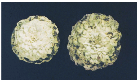
Figure 2. Alternaria flower blight.

Infected roots may turn dark gray, rot, and slough off resulting in wilting and death of the plant. Seedlings may also wilt and collapse (damp-off). Small (1 to 2 mm) but enlarging brown spots, sometimes with grayish white centers, appear on the petals of the ray flowers. The lesions may enlarge and involve entire petals, causing an unsightly blighting of the flowers (Figure 2).