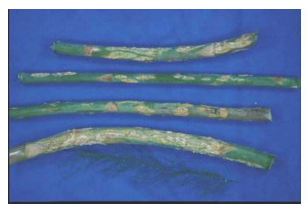
Figure 1. Asparagus rust-pycnia and aecia on spears.

Asparagus rust, caused by the fungus Puccinia asparagi , is found worldwide wherever garden asparagus ( Asparagus officinalis ) is grown. Rust is one of the most common and damaging diseases of this crop in Illinois. All aboveground parts of the plant may become infected. If the bushy green tops of fronds are attacked for several successive years, the crown and root system is weakened, reducing both the size and the number of edible shoots (spears) the following spring. Severely diseased plants may be prematurely desiccated and killed during the summer. Damage is most severe during prolonged dry periods. Asparagus plants weakened by rust are also very susceptible to the Fusarium wilt, root rot, and decline disease.