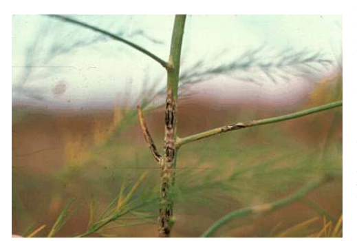
Figure 3. Telial pustules on asparagus stem and branches.

Large numbers of brick-red, almost spherical urediospores are produced in the small, dusty, cinnamonbrown pustules. These spores are carried by air currents to produce numerous infections on other asparagus plants, often in fields several hundred feet or more away. Successive generations of urediospores may be produced, germinate at once in the presence of moisture, and cause infections every 12 to 14 days until late summer, causing severely affected fields to appear reddish brown.