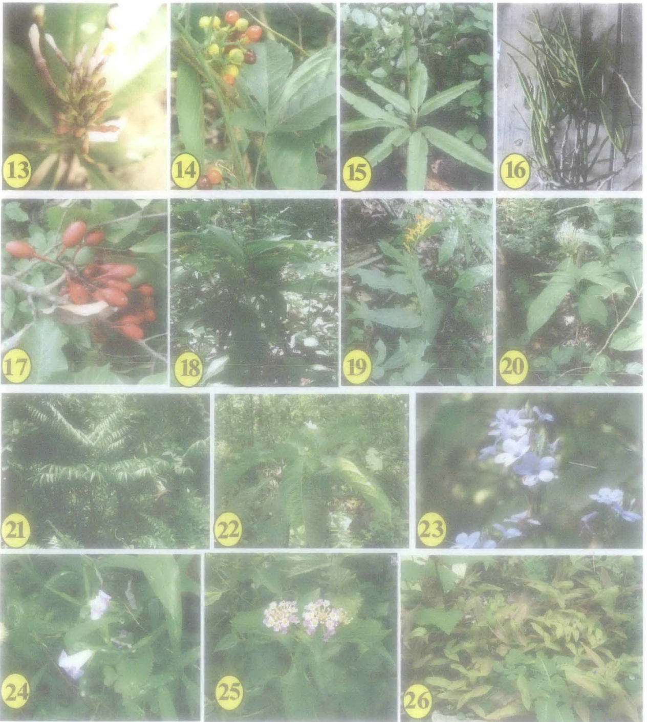
Plate II (Flora of Jainti):