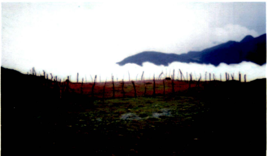
Enclosure of 2 years showed marked growth of vegetation inside and most species are in flowering stage