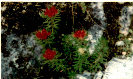
Rhodiola himalensis ; Family - Crassulaceae; Location - Samiti (4100 m)