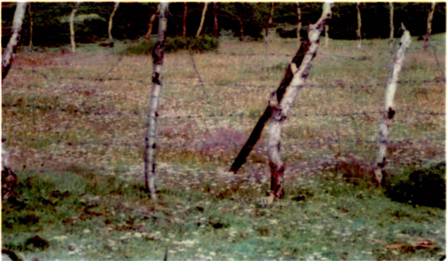
Vegetation difference in and outside the grazing enclosure after 1 year