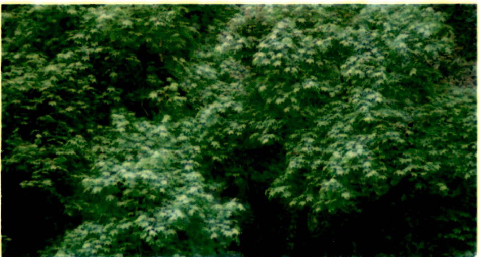
Acer campbellii , locally called "Kapasey" is a good fodder tree generally lopped for pack animals along the Yuksam-Dzongri corridor