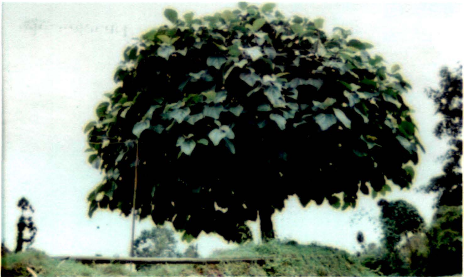
Ficus hookeri , locally called 'Nabhara' is most preferably planted by villagers because of its high production and good quality fodder