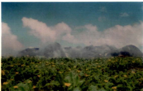
Potentilla peduncularis , an unpalatable alpine pasture species proliferated in a large area at Dzongri