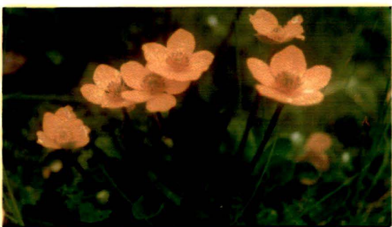
Caltha sp.; Family - Ranunculaceae; Location - Dzongri (3850 m)