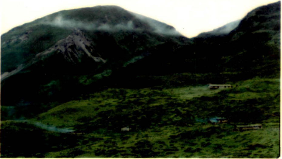
Panoramic view of pasture land at Dzongri showing herds of livestock