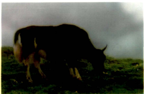
Yak grazing in Dzongri alpine pasture. The animal provides revenue from fur, meat and milk products