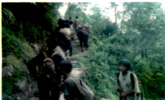
Pack animals on the corridor