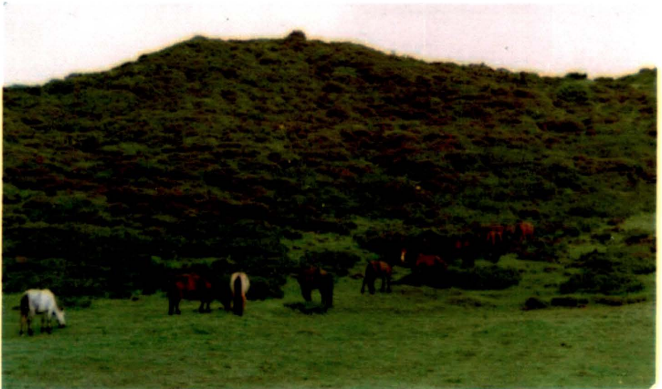
Horse (pack animal used by trekkers) grazing at alpine pasture near Rhododendron bushes