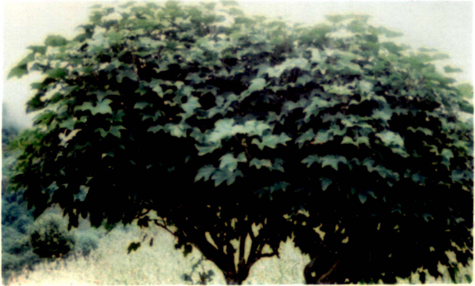
Brassaiopsis mitis , locally called 'Phutta' or 'Chuletro' is one of the preferred fodder tree planted in agriculture land or wasteland