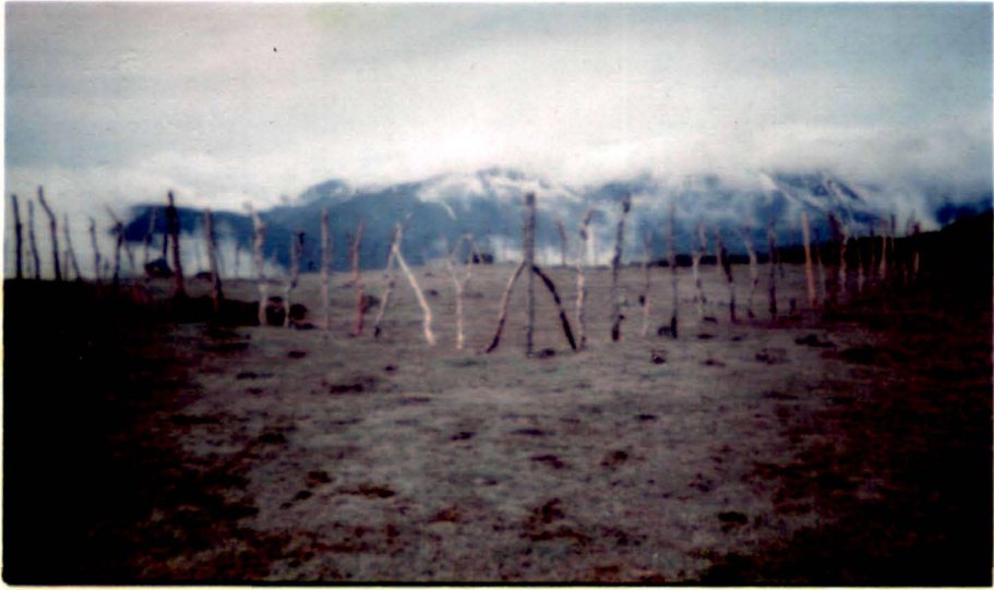
Livestock enclosure established in May 1997 at Dzungri pasture (3900 m)