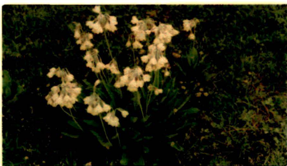
Primula sikkimensis ; Family - Primulaceae; Location - Dzongri (3850 m)