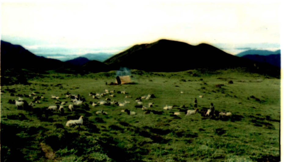
A flock of sheep in alpine pasture