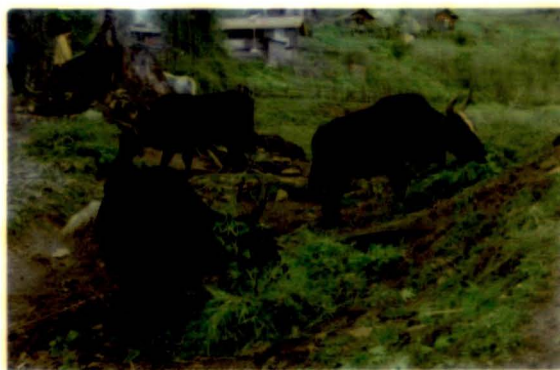
Pack animals (Dzo) feeding lopped fodder at Tshoka on the way to Dzongri