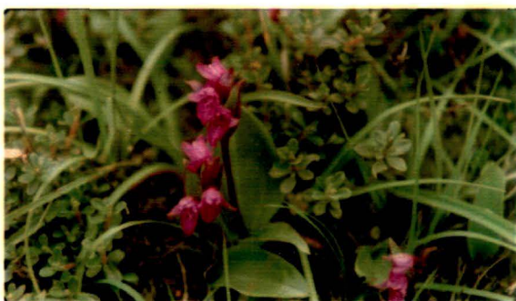
Galearis spathulata ; Family - Orchidaceae; Location - Deorali (3800 m)