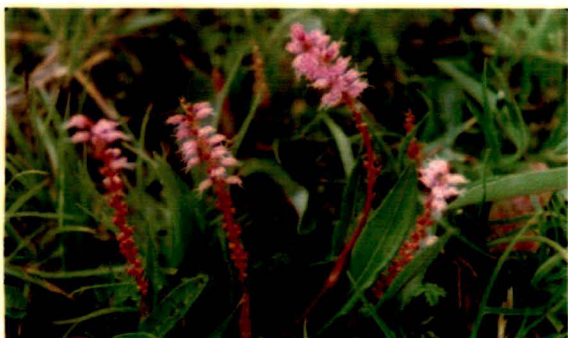
Bistorta affinis ; Family - Polygonaceae; Location - Dzongri (3900 m)