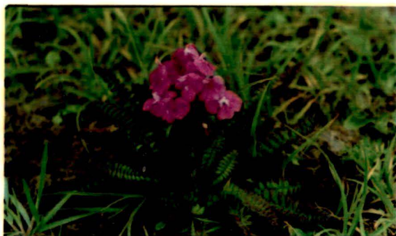
Pedicularis hoffmeisteri ; Family - Scrophulariaceae; Location - Dzongri (3900 m)