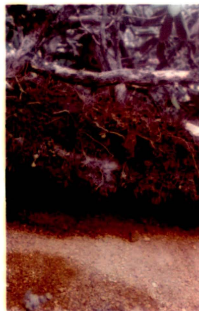
Trail erosion exposing soil profile on the Yuksam-Dzongri corridor. Rhododendron roots are exposed