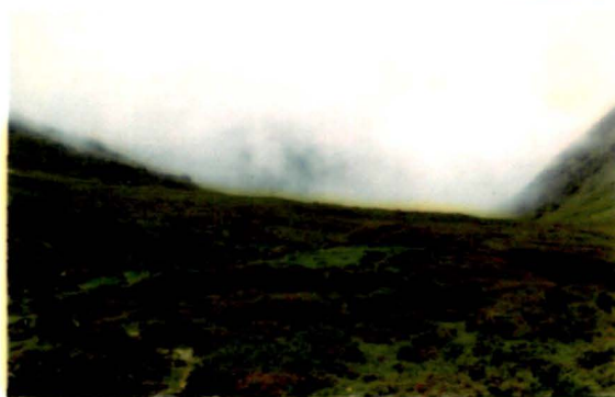
Rhododendrons are least palatable, however associated species are being grazed by yaks