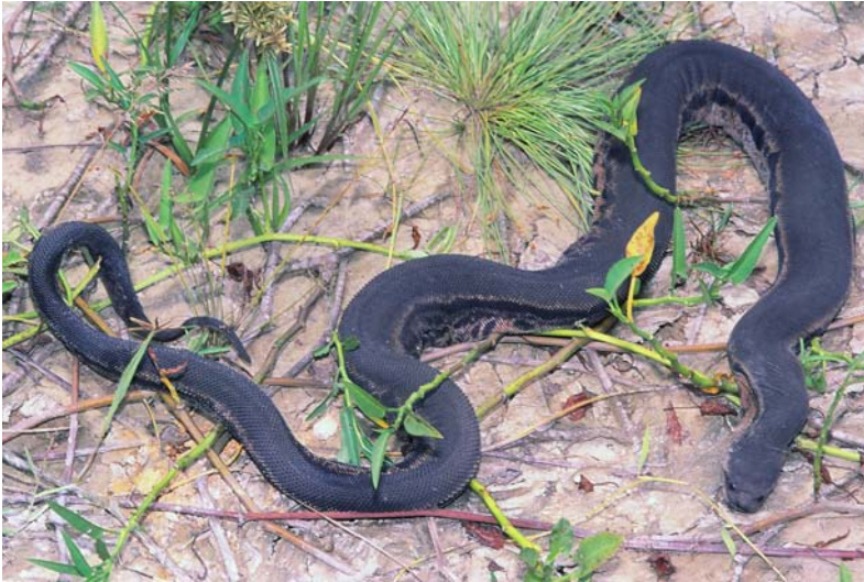
Elephant Trunk Snake ■ Acrochordus javanicus 200cm (Bahasa Malaysia/Indonesia: Ular Belalai Gajah. Hakka Chinese: Nai She. Iban Ular Pai. Thai: Ngu Nguang-chang)

DESCRIPTION Top of body is greyish black, the head with darker lines; 2 diffuse longitudinal stripes and elongated dark blotches are present on flanks; belly is cream. Compared to its relative, the Wart Snake (above), body is extremely stout and slightly compressed; head is indistinct from neck; forehead scales are small and rough; eyes are small with a vertical pupil; dorsals are keeled; mid-body scale rows are largest around vertebrals; tail is short but prehensile.