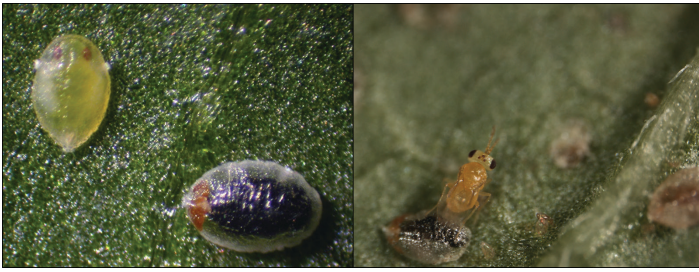
Figure 5. Parasitic wasp, Encarsia sophia parasitized B. tabaci (on left), parasitoid emerging (on right).