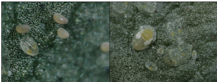
Figure 2. Whitefly, Bemisia tabaci Gennadius, immature stages.