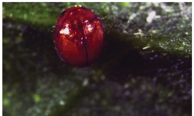
Figure 4. Predatory beetle, Delphastus pallidus adult.

Several biological agents are available for managing B. tabaci including predators (the mite Amblyseius swirskii , or the insects Delphastus catalinae , lacewing larvae), parasitoids ( Eretmocerus eremicus , Encarsia spp.) or entomopathogenic fungi ( Beauveria bassiana , Isaria fumosorosea ). Before applying any biocontrol agents (BCA), it is important to check with commercial vendors of BCA for their compatibility with chemicals and environmental requirements such as temperature, humidity, and day length. BCAs may not control an existing high population of whiteflies before significant crop damage occurs, so early application of agents before high pest buildup is recommended. Use of generalist predators can provide control of B. tabaci along with other pests of ornamentals. In Florida, B. tabaci is effectively managed on ornamentals and vegetables grown in greenhouses with Encarsia transvena . In our recent greenhouse studies focused on integrated management of MED on salvia and mint crops, we observed the predatory mite A. swirskii and parasitic wasp E. eremicus to be very efficient in managing this pest, respectively. Consult with your local UF/IFAS Extension specialist about the suitable biocontrol agents available for a specific crop.