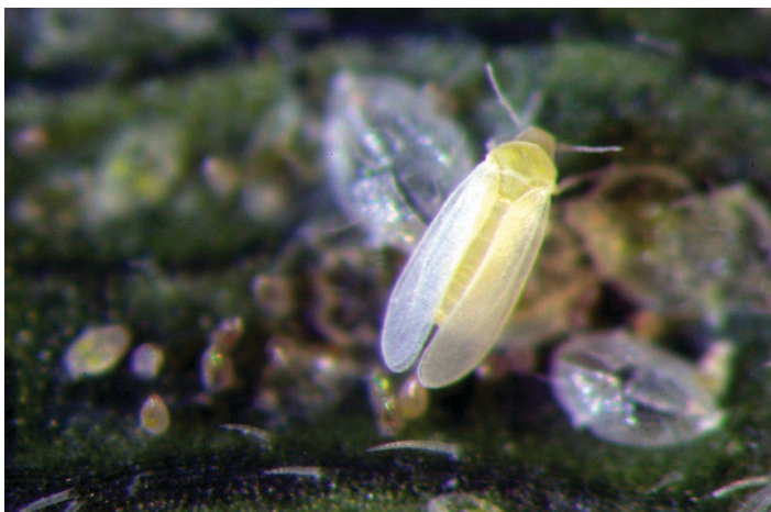
Figure 3. Whitefly, Bemisia tabaci Gennadius, adult.