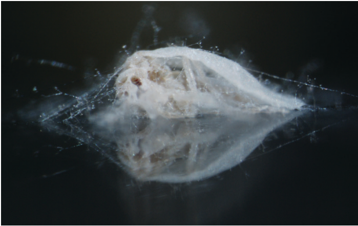
Figure 6. Whitefly adult affected by entomopathogenic fungi B. bassiana .