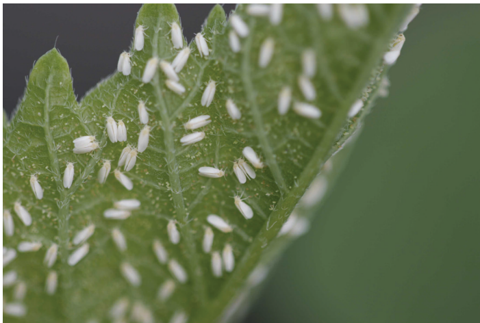
Figure 1. Whitefly, Bemisia tabaci Gennadius, eggs and adults.

manage and maintain whitefly populations throughout the initial propagation and active growth stages at levels that will minimize numbers on the final plant material being shipped. This will also minimize selection for insecticide resistance irrespective of whitefly biotype while helping to achieve top-quality plant materials. Growers should apply pesticides when scouting reports identify population densities at levels where experience and/or Extension personnel indicate action should be taken. These densities would depend on many factors including the crop, source(s) of infestation, and environmental conditions.