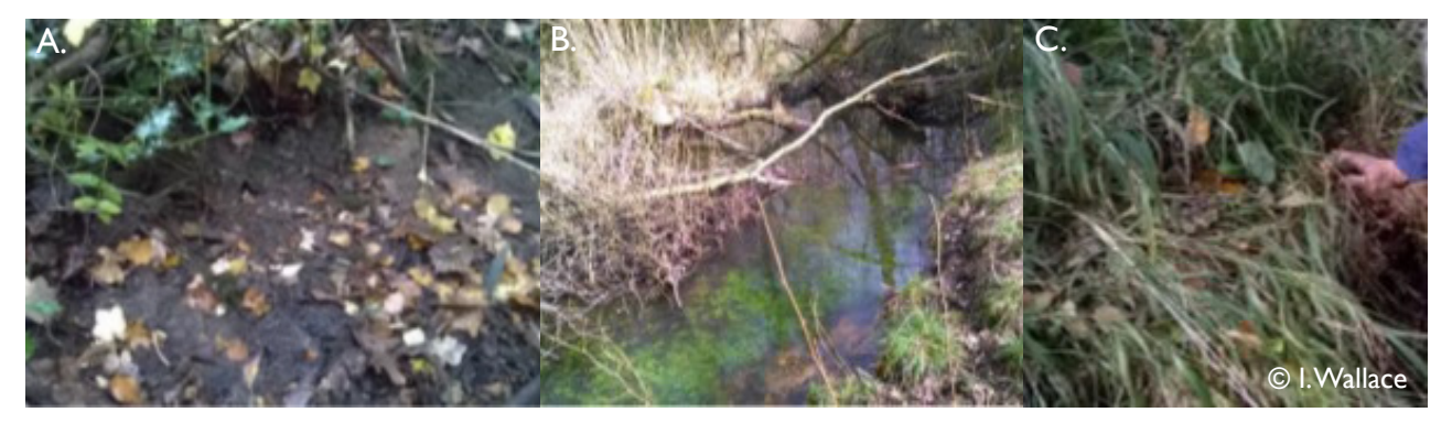
Figure 3: Habitats in Thompson Common, Norfolk, in which the caddisfly Ironoquia dubia lives: (a) damp streambed sediments suitable for dormant eggs and first instar larvae; (b) Stowbedon Stream, where later instar larvae were found at sites with sandy sediments and moderate flow in 2018 (Wallace, unpublished); (c) a grass clump suitable as a pupation site.

Specialists can be rarer in drier climates. For example, despite being a hotspot of biodiversity and endemicity for freshwater invertebrates, we know of few temporary stream specialists in