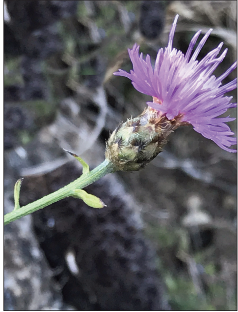
Fig. 6. Centaurea heywoodiana in flowering : see the terminal cauline leaves, mucronate at apex.