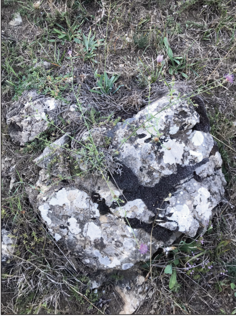
Fig. 5. Centaurea heywoodiana in its calcareous habitat (eastern slopes of Monte Musarra).