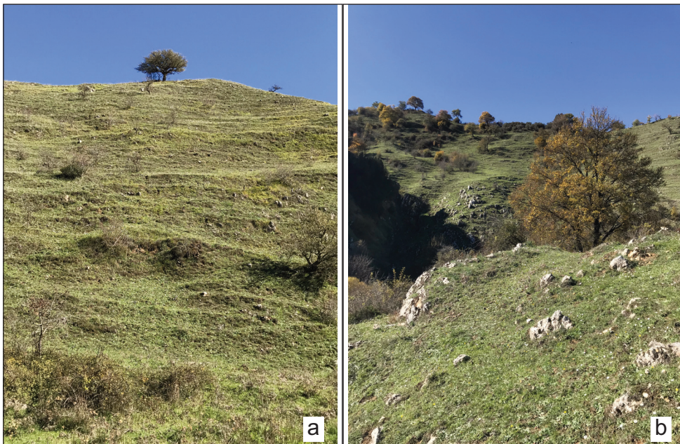
Fig. 4. The calcareous slopes of Monte Musarra, locus classicus of Centaurea heywoodiana (a); north-western slopes of Monte Colla where Centaurea heywoodiana also occurs (b).

The area that includes the locus classicus and the other nearby stations of C. heywoodiana falls within the potential space of deciduous oak forests of Q. cerris ( Quercetalia pubescenti-petraea Klika 1933), which occupy extensive areas on the Nebrodi Mountains. In its habitat, C. heywoodiana grows together with Dianthus siculus C. Presl, Thymus spinulosus Ten., Brachypodium pinnatum (L.) P. Beauv., Origanum vulgare L., Eryngium campestre L., Rosa canina L., R. montana Chaix, Sternbergia sicula Tineo ex Guss., Asphodelus ramosus L. subsp. ramosus , Clinopodium nepeta (L.) Kuntze, Trifolium ochroleucon Huds., Medicago lupulina subsp. cupaniana Guss., Plantago lanceolata L., Leontodon siculus (Guss.) Nyman, Carlina nebrodensis Guss. ex DC., Cirsium vallis-demonii Lojac., Reichardia picroides (L.) Roth., Bellis margaritaeifolia Huter, Porta & Rigo, Galium verum L., Asperula cynanchica L., Verbascum sp., Helianthemum sp., Allium sp., ecc.