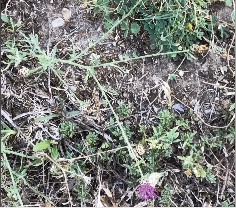
Fig. 2. Particular of the stem of Centaurea heywoodiana , branched and bifurcated at the extremity.