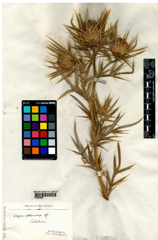
Figure 4. Lectotype of Ci. eriophorum var. vallis-demonii fo. calabrum Fiori (Fl., barcode FI053596), by permission of the Curator.

Distribution —Endemic to Italy: the autonym subspecies grows in northern Sicily (Peloritani, Nebrodi and Madonie massifs), while the subsp. calabrum occurs in Calabria (Sila, Serra San Bruno) [18]. The presence more northward is not confirmed; a presumed specimen of this species collected on Pollino massif (CAT-003141!) is rather to be referred to C. tenoreanum .