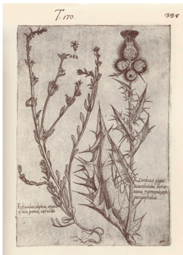
Figure 3. Lectotype of Ca. gigas Ucria (from the Panphyton siculum , plate 170, figure on the right side).

Notes on Ci. elatum —Todaro [62] published this name in Latin with description, diagnosis, habitat and indication of the loci classici , all in southern Sicily: “ Monti di Rifesi, vicino Palazzo Adriano, fiume della Verdura sotto Ribera ”. He also pointed out that he had preserved the plant in the Herbarium Panormitanum under the name Cnicus elatus . We located a pertinent specimen at PAL (no. 10462, http://147.163.105.223/herbarium_vdetails_en2.asp?idmode=simple&id=22454 ). It includes a basal leaf and a cyme of mature heads, and was collected by Todaro himself at Ripesi, one of the loci classici , before the publication of the protologue. It is included in the fascicle of Cn. elatus , and, on the basis of the reference in the protologue, it could be even regarded as a syntype. Its examination fully supports the synonymization of Ci. elatum Tod. with Ci. scabrum (see Fiori [52]). Nevertheless, the name is illegitimate under Art. 53.1, because of the existence of the prior Ci. elatum by Sauter [63] (p. 130).