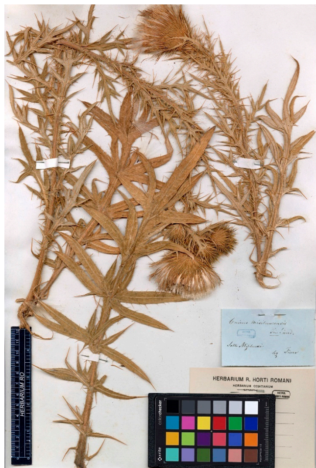
Figure 6. Lectotype of Ci. misilmerense Ces., Pass. & Gibelli (RO), by permission of the Curator.

name. Even if regarded, especially in the past, as a distinct [78,87,88] or a critical species [18,89], Ci. misilmerense is nowadays mostly included in the variability of Ci. vulgare subsp. crinitum [6,19].