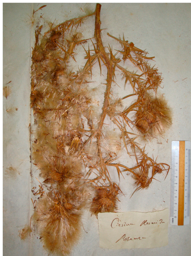
Figure 5. Neotype of Cn. rosani Ten. (NAP), by permission of the Director.

Notes on Ci. rosani —Contextually with the name Ci. lobelii , Tenore [48] (p. 14) published also a new species in Cirsium , dedicating it to his correspondent Francesco Antonio Rosano (1779–1843), who first gathered the plant in Basilicata (a region of southern Italy). The protologue includes a Latin description and the provenance (“In arvis Lucaniae prope Potentiam ”, i.e., “in the fields of Basilicata near the city of Potenza”). Also in this case, Lacaïta [46] (p. 125) indicated an “autotipo” from Tenore’s herbarium, a single specimen gathered in Potenza (Basilicata) by Rosano (Figure 5). Probably, it is original material; however, there is no definitive proof on the matter. Lacking certain original material, the designation by Lacaïta must be retained. After the examination of the available material and the original description, and according to our broad circumscription of Ci. vulgare , Ci. rosani can be considered a heterotypic synonym. The plate in Flora napolitana [48], published slightly later than the protologue, supports this identification.