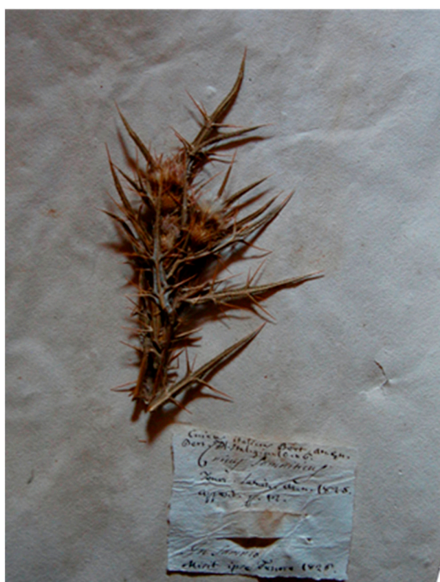
Figure 2. Neotype of Cn. samniticus Ten. (BOLO), by permission of the Curator.

1826. The only useful exsiccatum preserved in the Tenore Collection (NAP) bears a label by the author without the date of collection (" Cnicus samniticus \ C. spinosissim. Florae nap. prodr. \ in Samnio") and it is represented by an individual with flowers and ripe heads. The only other specimen that we were able to locate is preserved at BOLO: nowadays it is reduced to a single fragment of flowering scape, and collected "in Samnio". This specimen was labelled by Tenore himself as Cn. samniticus . In 1826 Tenore sent this specimen to Bertoloni, who added on the same label the references and the accepted name, i.e., Cn. italicus (cf. [45], p. 10). In our opinion it could be considered as original material for the name, but a definitive proof is lacking. In any case, it fully matches the original description [44]. We here prudentially propose it as neotype according to the Art. 9.7. Nowadays, Ci. samniticus is regarded a heterotypic synonym of Ci. italicum [18], and we agree by examining the relevant specimens (stems partly winged; small and glabrescent heads crowded upwards and exceeded by the apical leaves; involuclral bracts vittate with patent spines).