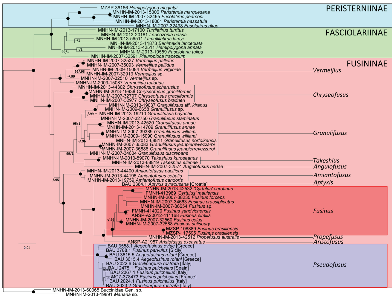
Fig. 1: ML tree (G3 dataset) portraying the relationships among lineages of Fasciolariidae. Lineages of Fusiniinae corresponding to currently accepted genera are marked. A clade corresponding to a restricted concept of Fusinus s.s. (see also Couto et al. , 2016, and Kantor et al. , 2018) is highlighted in red; in violet a clade of Mediterranean species currently classified in Aegeofusinus , Fusinus and Gracilipurpura . Numbers at nodes correspond to ultrafast bootstrap support for ML, and posterior probability for BI, respectively (only UfB \geq 0.95 and PP \geq 0.95 are reported; closed circles indicate 100% BS and 1 PP).

All single-gene trees are reported in Supplementary materials (Figs S1-S8). In our multilocus G3 and G4 trees (Figs 1, 2) the included fasciolariids always formed three