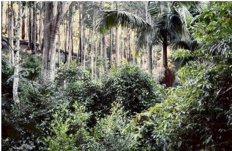
E. saligna , E. pilularis and Syncarpia glomulifera above a rainforest gully in the Wattagans

2D. In the Wattagans, there is usually a dense shrub layer where the forests occur on Triassic sandstones and Tertiary basalts in areas with rainfalls of 1150 - 1250 mm. E. saligna is generally the dominant species with E. pilularis and Syncarpia glomulifera . Associated trees include E. acmenoides , E. agglomerata , E. microcorys , E. scias , E. deanei , E. piperita , E. sieberi and Corymbia gummifera . Near the transition to the woodland and lower open-forests, Angophora costata , A. floribunda , E. amplifolia and E. punctata may be found.