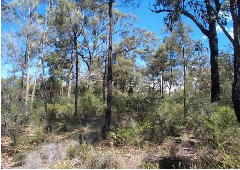
Pokolbin - Broke