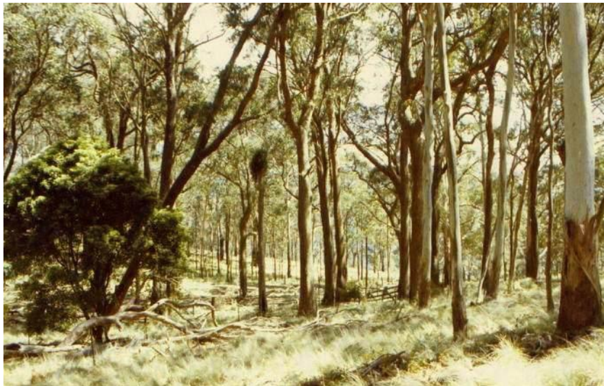
In more exposed parts on the Liverpool Ra. the woodland is more open