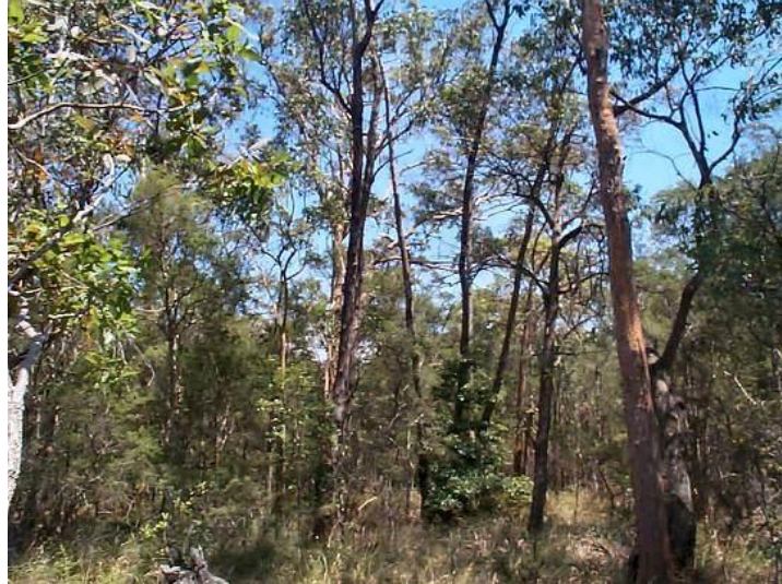
Eucalyptus open-forest of on a protected site, near Lake Macquarie