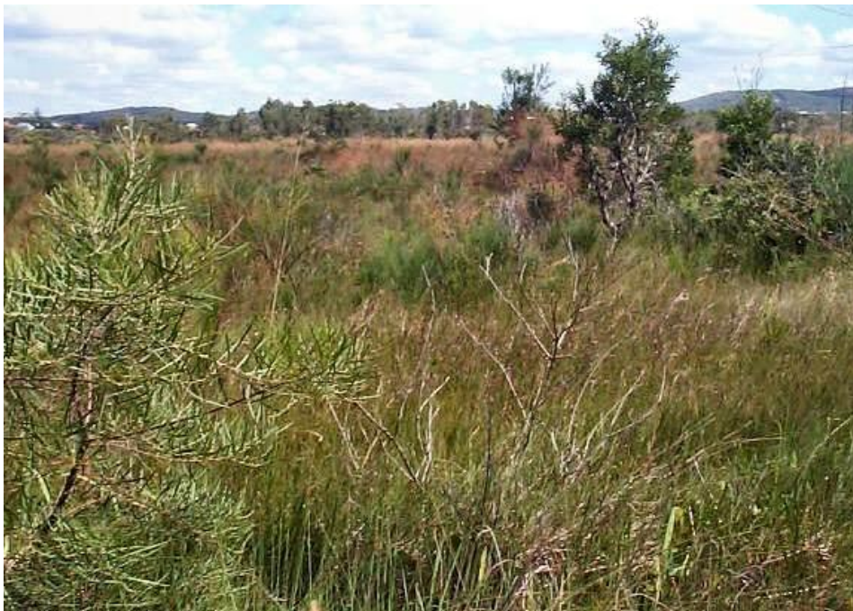
Wet heath on periodically inundated coastal sands near Belmont