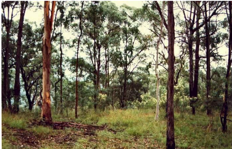
An eucalypt open-forest of E. punctata and E. eugenioides in the headwaters of Apple Tree Ck.

Mixed Eucalypt Open-forest is comprised of a variety of eucalypt canopy species with decreasing diversity westwards but at the same time the shrub layer becomes more complex. To the east occurs Angophora floribunda , A. euryphylla , E. agglomerata , E. deanei , E. eugenioides , E. sparsifolia , E. pilularis , E. punctata , E. saligna , E. sieberi and Syncarpia glomulifera . The E. agglomerata , E. eugenioides , E. oblonga , E. piperita and E. punctata continue westwards and are joined by Corymbia gummifera and C. eximia towards the central area but do not extend fully westwards. In the western parts E. multicaulis occurs.