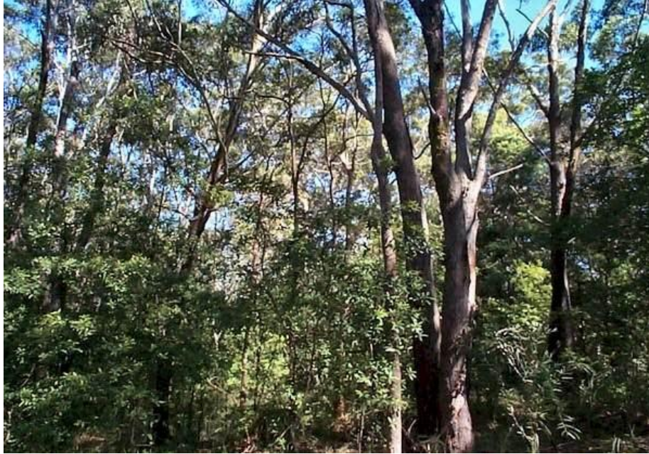
On better soils a dense understory often occurs, as near Port Stephens

This sub-formation also includes a number of very different communities, e.g. on a headland north of Newcastle occurs this Leptospermum low closed-forest, and near Anna Bay is this closed-forest of Acacia binervia .