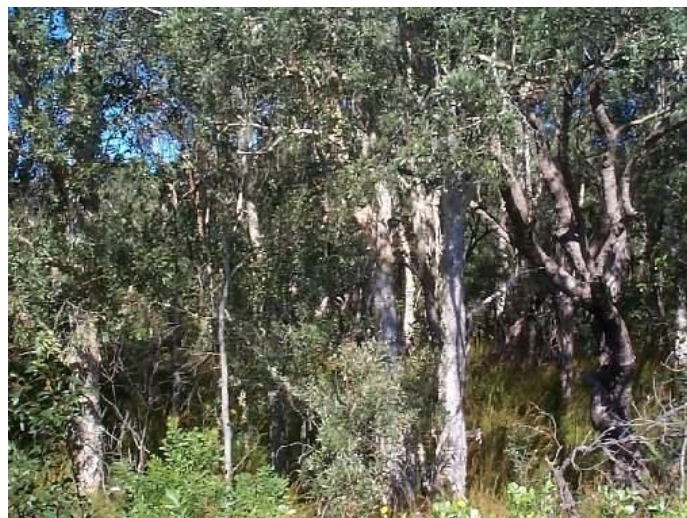
A dense stand of Melaleuca quinquenervia with a fern and sedge ground cover in a coastal wetland south of Newcastle