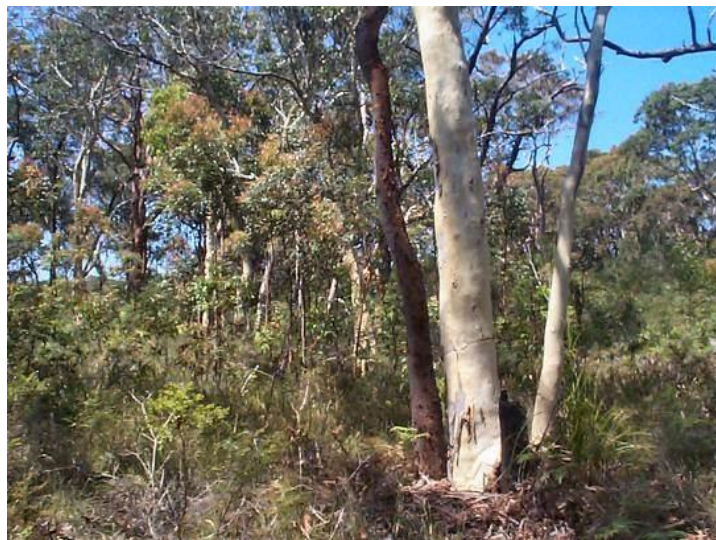
Eucalyptus - Angophora costata open-forest on low nutrient soil near Gateshead