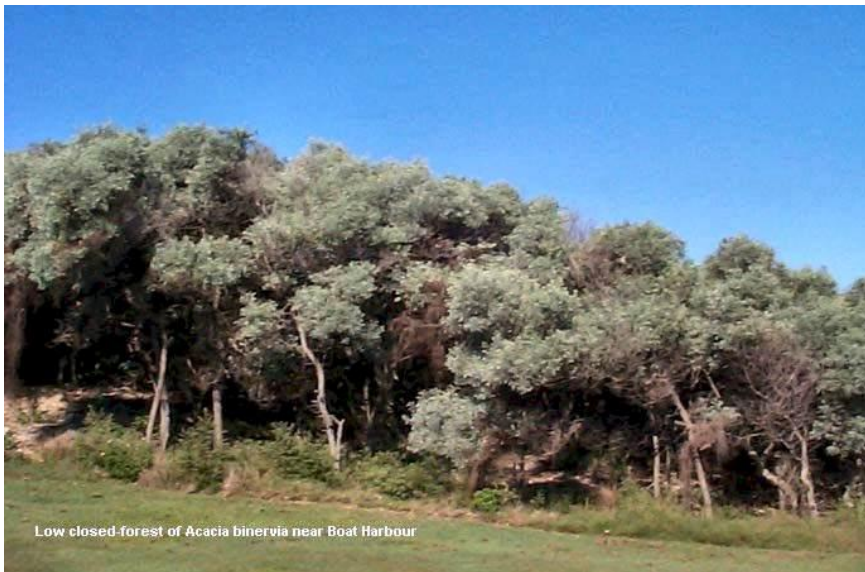
Low closed-forest of Acacia binervia near Boat Harbour

This sub-formation also includes a number of very different communities, e.g. on a headland north of Newcastle occurs this Leptospermum low closed-forest, and near Anna Bay is this closed-forest of Acacia binervia .