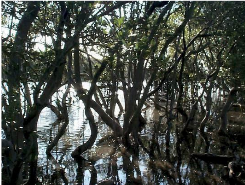
Avicennia marina mangroves along the Hunter River.

Along waterways and on mud flats in the intertidal zone, mangroves form narrow bands of small trees of uniform height with a dense canopy. One or two species, Avicennia marina and less frequently Aegiceras corniculatum , only are present. Sarcocornia quinqueflora and other halophytes and the sedge Juncus kraussii may occur on the tidal areas to the landward side of the mangroves. Whilst not classified as "rainforest", mangroves usually have a closed canopy.