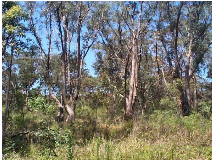
Eucalyptus piperita open-forest on a dry site south of Newcastle