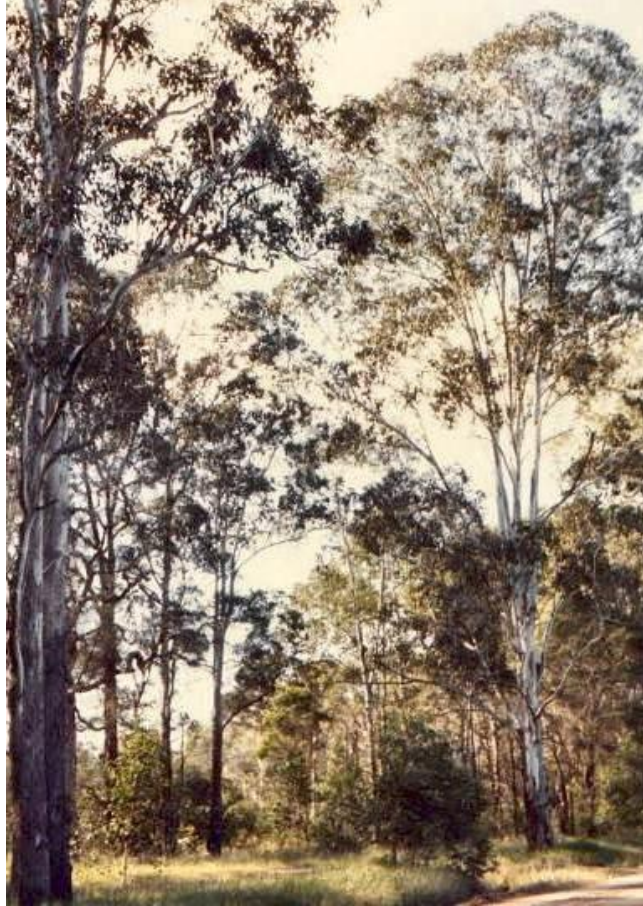
Eucalyptus tall woodland north of Raymond Terrace