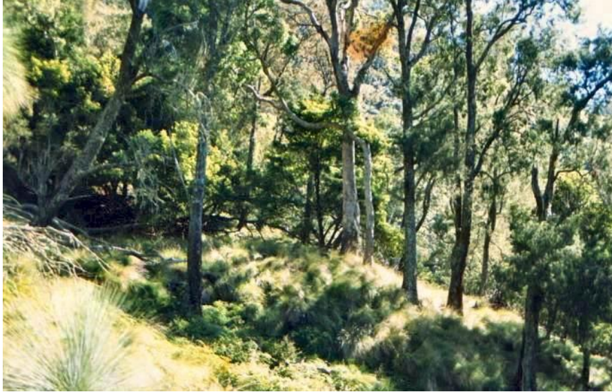
In the protected parts on the Liverpool Ra. the woodland merges with close-forest "brush"