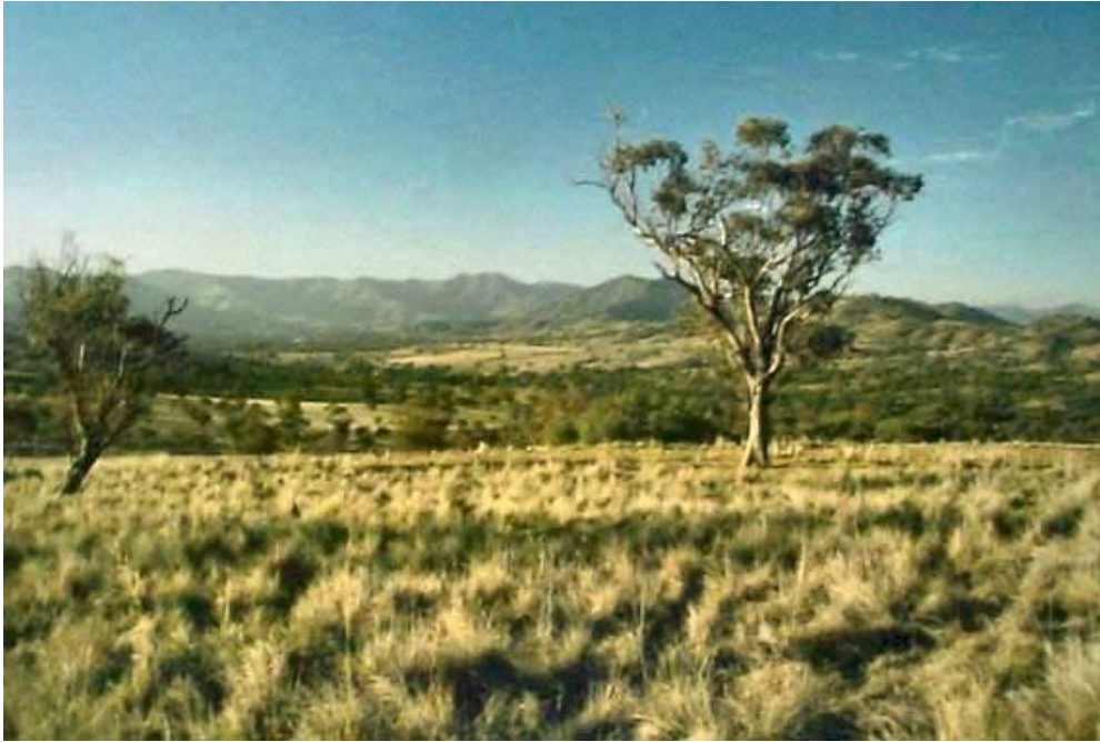
Grasslands on the Merriwa plateau

In the lower Hunter Paspalum and Sporobolus species predominate.