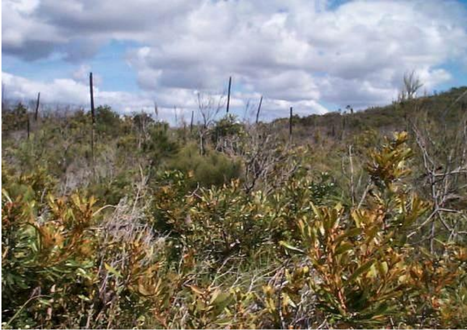
Heath on the coastal aeolian sands near Redhead

Near the coast, heaths occur on exposed coastal sands, dune systems and headlands.