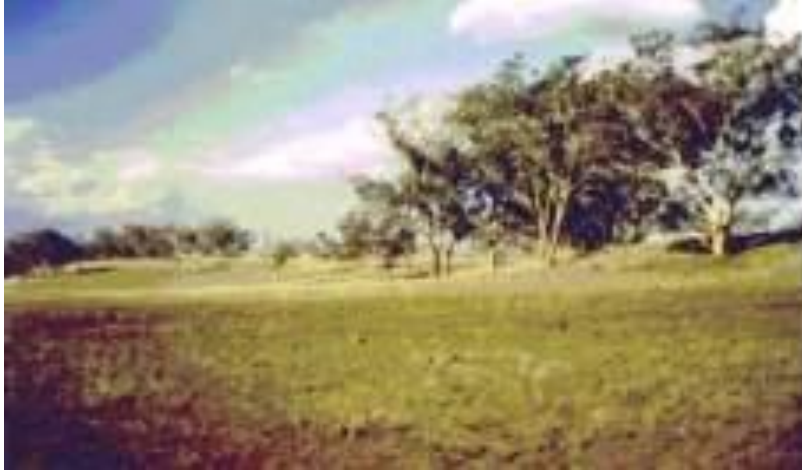
Open-woodland - grassland in the river valleys on the Merriwa plateau

lying areas and Brachychiton populneus is scattered throughout the formation. Ironbarks are absent. Grass cover is predominantly species of Austrostipa , Dichanthium , Chloris and Notodanthonia linkii and Aristida ramosa .