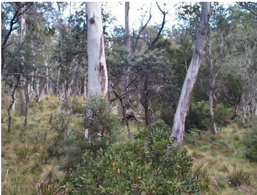
Sub-alpine woodland of Snow Gums with a grassy ground cover and mixed understory on the Barrington plateau

The Sub-alpine Woodland occurs above the Cool Temperate Closed-forest and Eucalyptus Tall Woodland on the higher and exposed hills of the Barrington Tops - Tubbrabucca plateau, at an altitude of 1350 to above 1500 m. Here the substrate is Tertiary basalt and the rainfall is from 750 - 1500 mm. The dominant tree is E. pauciflora , about 15 m tall, with E. dalrympleana and E. stellulata as associates. The canopy cover is mostly sparse but in places the canopies may touch. A shrub understory is sometimes present, and where this occurs, Acacia dealbata subsp. subalpina is the common shrub species along with species of Tasmania and Dicksonia antarctica . Mostly a tussock grassy ground cover of Poa labillardierii is present. In sheltered areas, stunted Nothofagus moorei and Elaeocarpus holopetalus closed-forest may occur.