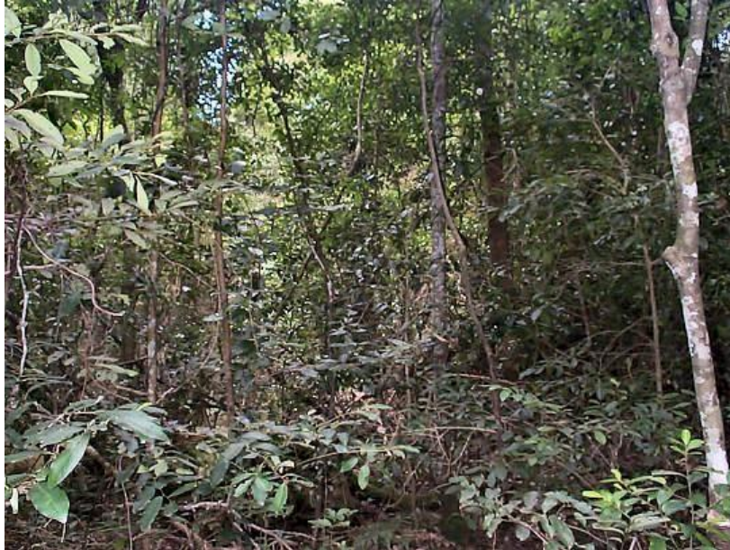
Warm Temperate Rainforest in Bow Wow Gorge

In this sub-formation emergents are fewer, the canopy is not as high and a sub-canopy may also be present. Epiphytes are fewer, but lianas are common and ferns are often present on the floor. Tree and shrub leaves are also smaller. They generally occur at altitudes above the STRf and may merge with the CTRf at the upper limit. They also occupy the less favourable areas of lower moisture and/or greater exposure or lower temperatures. Many of the same species that are present in the STRf also occur here but the species richness is reduced.