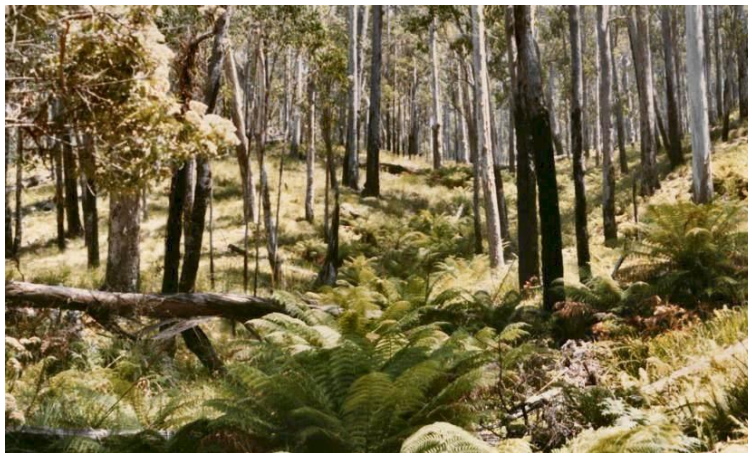
Mixed eucalypts forest with a tree fern understory on the Barrington plateau.