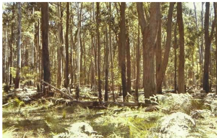
Tall open-forest of E. laevopinea on the Coolah plateau.