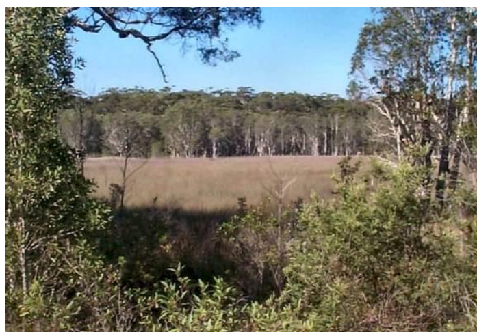
A Phragmites wetland in the swales of the dunes supporting open-forest north of Newcastle