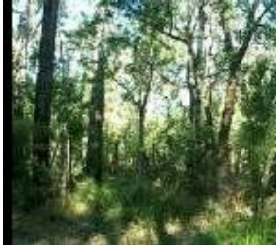
Open-forest of Blackbutt and Banksia on the Quaternary sands behind Newcastle Bight

3A. The Mid-high to Tall Open-forests occur as three well defined alliances. On the coastal Quaternary sands north of Newcastle where the rainfall is from 900 - 1000 mm, Tall Open-forests of Angophora costata , E. pilularis and Corymbia. gummifera occur. The open canopy is about 20 m high and there is a sparse lower layer of small trees and a closed shrub or herb layer. Besides the three dominant species, other species include E. globoidea , E. racemosa , E. parramattensis subsp. decadans and E. robusta , with smaller trees such as Banksia , Melaleuca and Persoonia . Much of this original forest has been altered since settlement, and in disturbed areas invasion by weeds, including Senecio lautus , Chrysanthemoides monilifera and Lantana camara is prolific. On exposed sand dunes, Hydrocotyle bonariensis , Scaevola calendulacea and Spinifex hirsutus predominate.