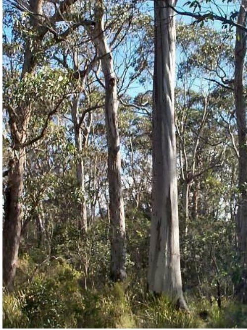
and E. dalrympleana on the Barrington Tops.