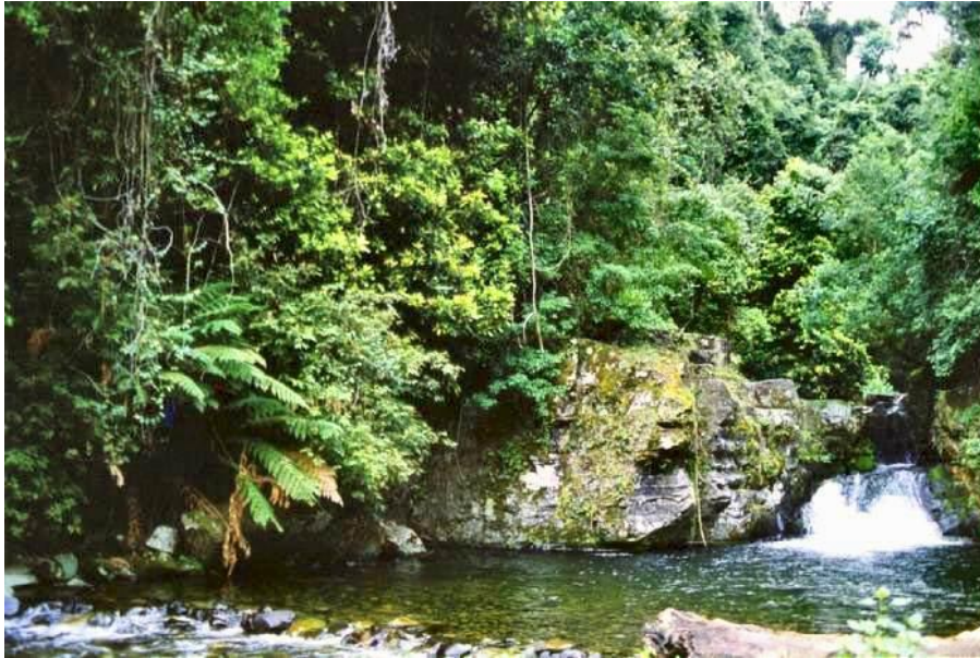
Subtropical Rainforest in the Williams River valley.

In the Subtropical Rainforest the upper canopy averages about 30 m tall with scattered emergents, typically usually of Eucalyptus or Ficus species. A lower sub-canopy, about 7 m tall, may be present, and epiphytes and lianas are common, but the floor is usually relatively open. They occur in the deep valleys, usually with a southern to eastern aspects and at lower altitudes where richer soils have accumulated. Numerous species are present, producing a high species richness, and the trees and shrubs have relatively large and soft mesophytic leaves.