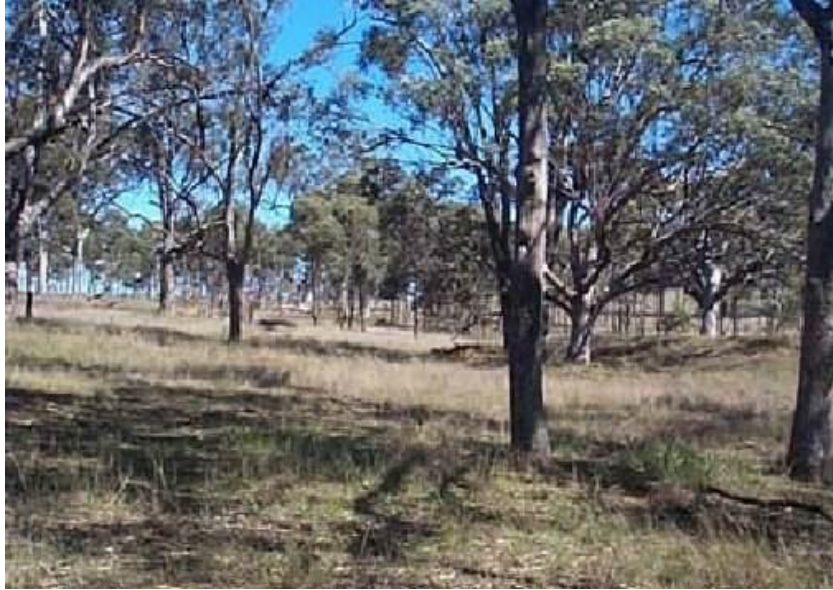
Gum-Ironbark-Box Woodland with a grassy ground cover in the central valley

the sub-formation E. tereticornis and C. maculata are replaced by E. blakelyi , E. dawsonii and E. punctata , particularly where it joins the Woodland - Shrubland. E. moluccana and E. crebra often form an exclusive alliance. Further inland, E. moluccana grades into E. albans and E. microcarpa , and E. crebra is joined by E. fibrosa , E. nubila and E. caleyi (near Murrumbo). E. melliodora becomes increasingly frequent from about the centre of the range. In the east the ground cover is composed of Sporobolus indicus var. capensis , Paspalum dilatatum , Themeda australis , Aristida species and Cynodon dactylon . Dichanthium sericeum occurs throughout the sub-formation except on sandy soils and dry areas where it is rare, whereas Aristida species are common across the whole range. Notodanthonia linkii is most common in the western half of the range where Austrostipa setacea also occurs. The greater part of this woodland has been thinned or cleared, with remnants of the former woodland existing only in scattered pockets.