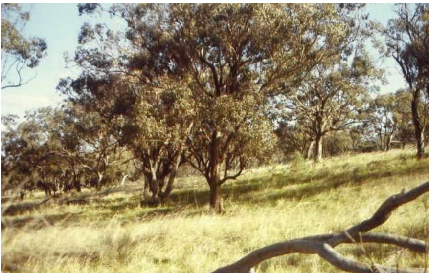
E. albens open-woodland in the far west of the Valley on the Dividing Ra.