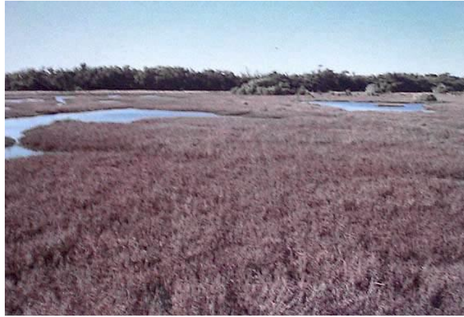
Saltmarsh in the Hunter River estuary