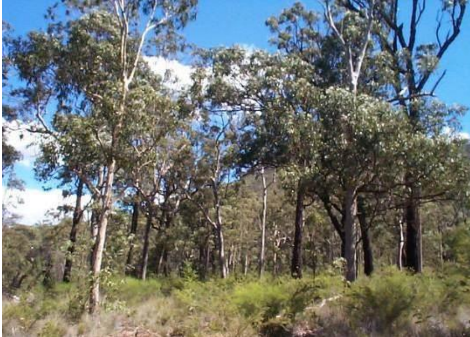
Near Bulga in the central part of the Hunter Valley

Further inland, heaths occur in other formations, particularly in the Open-forest and Woodland - shrubland subformation, on exposed or seasonally wet and poorly drained areas and on thin skeletal soils of the Triassic sandstone and granite areas. Here dry heath occurs as an understory in ironbark woodland-shrubland.