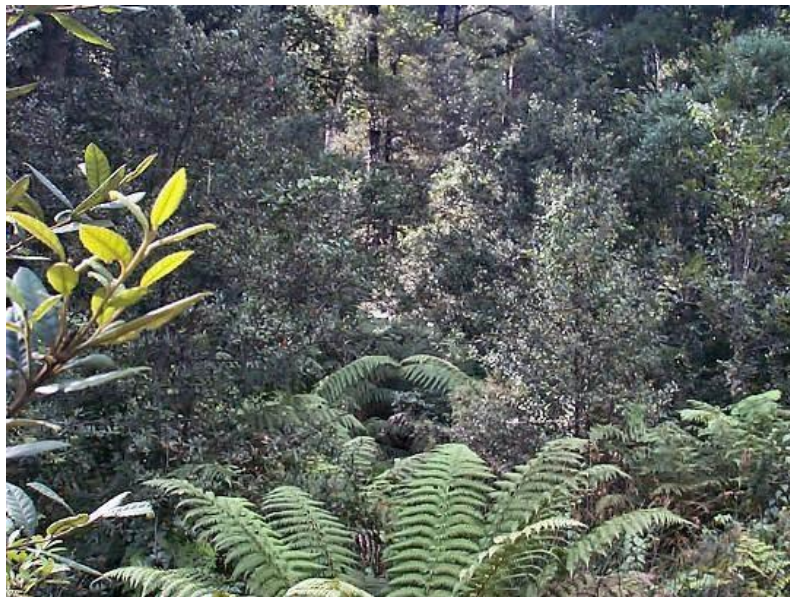
Cool Temperate Rainforest in a south facing gully on Barrington Tops.

The Cool Temperate Rainforest canopy is relatively even, lianas are absent and the floor is often dense with mosses, ferns and tree ferns. They occur in similar aspects to the WTRf but at higher altitudes where the average temperatures are lower. The number of species is few, Nothofagus moorei is dominant, and Doryphora sassafras may be locally common. The tree ferns are Dicksonia antarctica .