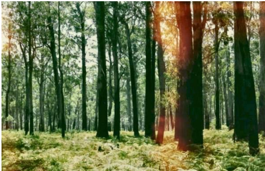
Very Tall Open-forest of E. fastigata and E. obliqua on Tomalla Plateau

2A. On the Tomalla plateau and parts of the Liverpool Range, Very Tall Open-forests of trees 30 - 40 m tall, usually with a sparse shrub layer and ferny or grassy floor, occur on basalts where the rainfall is 750 - 1500 mm. Main tree species include Eucalyptus laevopinea , E. viminalis and E. fastigata . E. pauciflora may be dominant in localised areas. Other eucalypts include, E. dalrympleana , E. obliqua (Tomalla - Barrington Tops area), E. stellulata , E. nobilis and E. saligna . Shrubs are common and Acacia dealbata subsp. subalpina often occurs in fire promoted thickets. Poa labillardieri is the dominant ground cover.