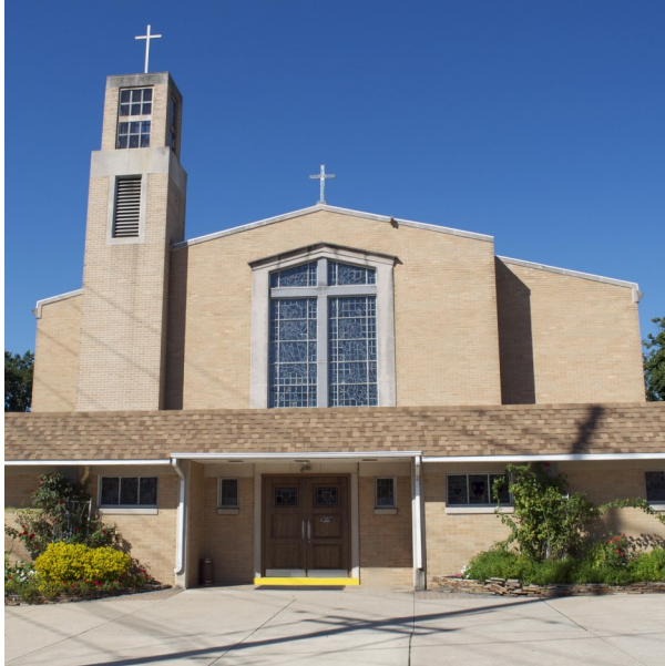
St. Teresa of the Infant Jesus Church 13 E. Evesham Road

“Two beautiful churches, one GREAT parish.”