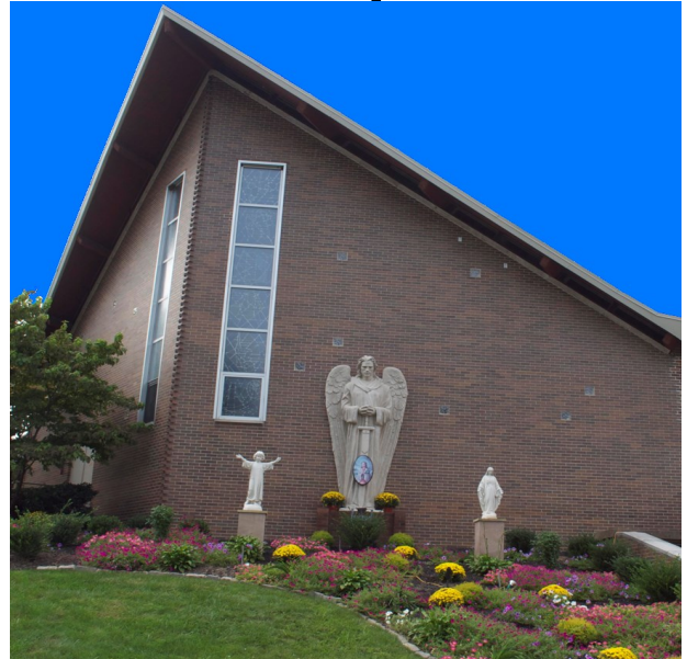
St. Maria Goretti Church 321 Orchard Avenue