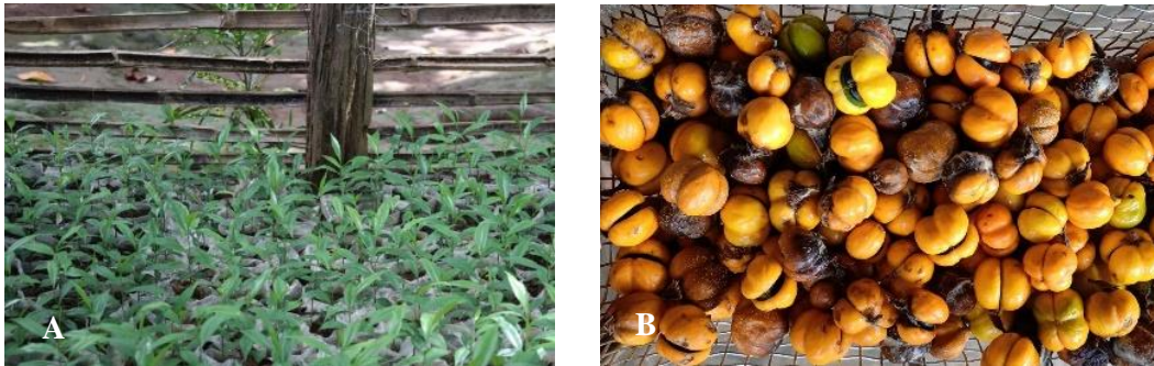
Fig. 3 Aquilaria malaccensis seedlings (A) and Aquilaria cumingiana seeds (B) owned by one of the respondents

Based on the interview results, in 2019, when Aquilaria became widely known, the value of seedling rose to 500 to 1000 Pesos. The seedling, particularly from Aquilaria malaccensis (Fig. 3A), generates higher income since wildlings are abundant in the forest. According to Chua (2008), Aquilaria malaccensis produces seeds after 7-9 years, while some other species produce seeds only once in their life cycle.