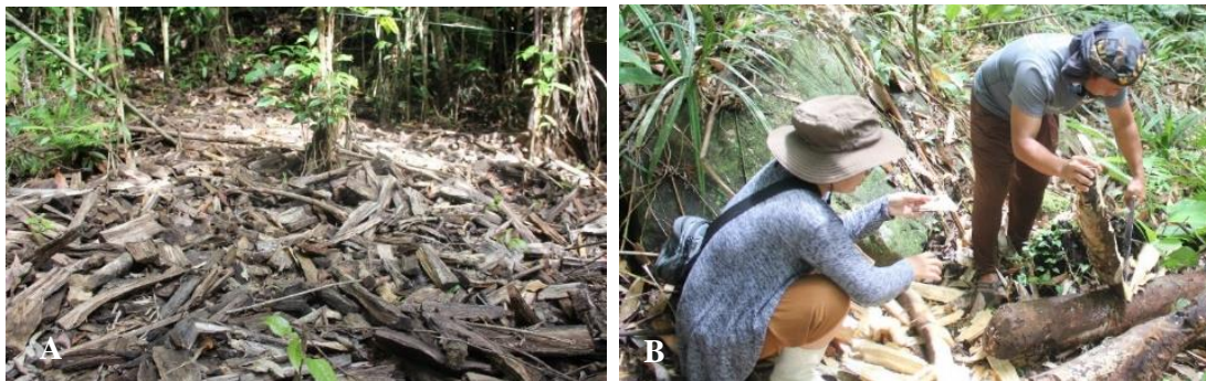
Fig. 2 Local practice in harvesting Aquilaria in the study site

In the study site, five illegally-cut matured Aquilaria were documented and recorded. Meanwhile, a community resident began harvesting Aquilaria in the forest in June 2019. According to the respondent, since it was difficult for them to identify the exact Aquilaria trees, they would randomly cut trees without properly distinguishing them and chopping them into pieces (Fig. 2A). Until eventually, traders from other countries (China and Taiwan) and other places within the Philippines (Mindanao and Samar) came and trained them to identify and distinguish the Aquilaria tree.