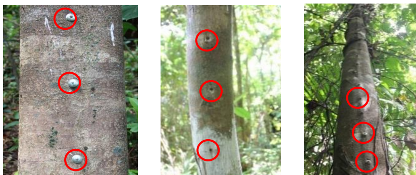
Fig. 4 Locally practiced method of inflecting (by punching nails and drilling holes at the trunk) matured Aquilaria species in the community