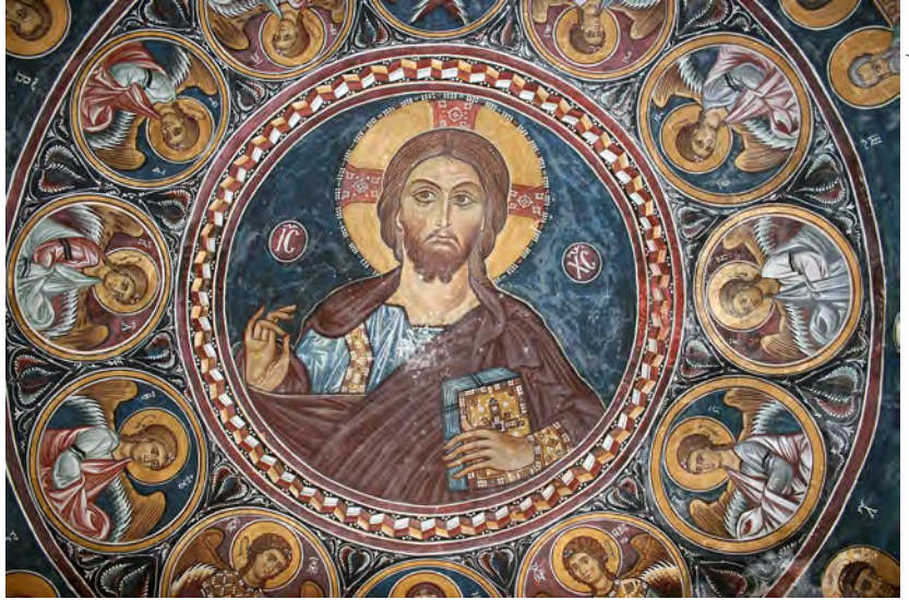
Pantokrator, Byzantine Church, Panagia Phorbiotissa, Asinou, Cyprus, 14 th c. Fresco.

The exhibition is open weekdays from 9 – 4 (except holidays; also closed Dec. 22 – Jan. 2).