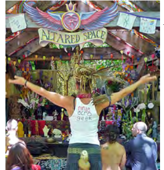
Altared Space, Oregon County Fair, July 2011.

"Sensational Religion" is sponsored by the Initiative for the Study of Material and Visual Cultures of Religion with the Yale Institute of