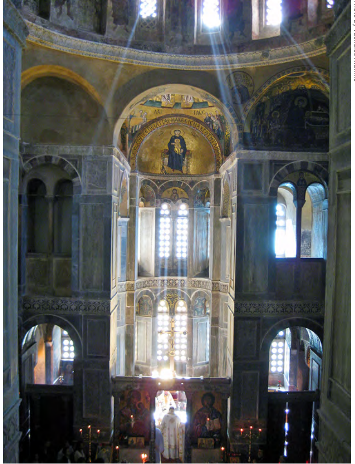
11 th century Orthodox Church.

These are some of the issues that will be explored Nov. 10 – 11 in a multidisciplinary conference Looking East: A Window on the Eastern Christian Traditions of Epiphany hosted by the Yale Institute of Sacred Music with support from the Ockeghem Foundation. Geared for an informed general audience as well as those with a scholarly interest in the subject, the conference will offer separate sessions on musical, liturgical, and artistic/architectural perspectives, a discussion with practitioners from local Orthodox congregations, Orthodox worship in Marquand Chapel, and a talk on teaching Coptic