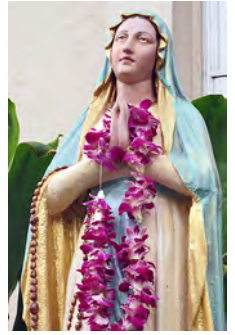
Our Lady of Lourdes, Lahaina, Maui, May 2011.

The subjects of the three thematic conference sessions are: "Possessions," including spirit possession, self-possession, and material possessions; "Transgressions," including transgressions of/by objects, people, and/or spaces; and "Transformations," concerning material, spiritual, spatial metamorphoses. Conversational panels take up the subjects of "Devotional Bodies"; "Iconoclastic Objects"; and "Contested Grounds." "Devotional Bodies" focuses on an intersecting constellation of issues including ideas of embodiment, materiality, devotional/religious practice, sensory hierarchies, and cultural constructions of race and gender. "Iconoclastic Objects" engages sensory contentions more directly, examining objects that have, for a variety of reasons, elicited controversy and hostility among specific groups of people. "Contested Grounds" turns to spatial considerations of places, boundaries, barriers, bridges, and, in each case, especially those spaces considered sacred. Here the geographical or categorical movement of objects into specific conceptual, architectural, civic, or environmental spaces will also shape subjects.