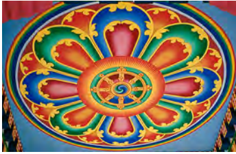
Mandala, Washington, D.C., 2003.

Sensational Religion is organized in three thematic sessions of scholarly papers and three conversational panels designed to elicit robust discussion among panelists from different vocations and religious traditions. A framing address and conference overview; an extended public exchange on art, religion, and display; a New Scholarship Roundtable; and an exhibition entitled Making Sense of Religion in the Yale Archive: Themes and Contexts in American Christianity, Nineteenth Century – Present contribute to the conference's formats for collaborative investigation.