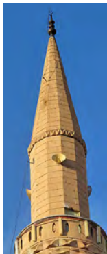
Minaret, Sinasos, Turkey, March 2011.