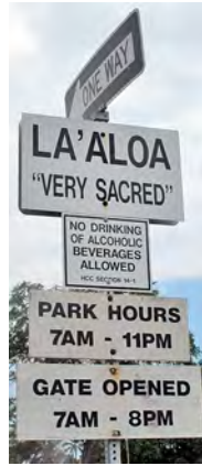
Signage at La'Aloa, Big Island, Hawaii, April 2011.

The Initiative imagines numerous arenas of activity, in real and virtual spaces. It shapes an interdisciplinary scholarly center for religion and visual/material culture studies at Yale University. From this local base in New Haven, it aims to facilitate a network of institutional and individual collaborators and imagines many partners in this work. In implementing this Initiative, we intend multiple audiences in varied settings, including higher education, religious community, arts and architectural professions, museums, and civic life, and we invite interaction with and among them.