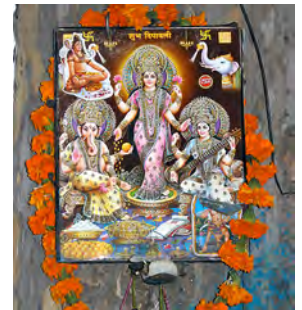
Lakshmi Tree Shrine, Delhi, India, March 2010.

In its founding years and first program cycle, the Initiative is generously supported by the Henry Luce Foundation, the Yale Institute of Sacred Music (ISM), and Yale University.