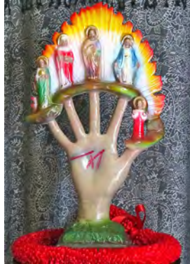
The Powerful Hand , chalkware devotional object, 2010.

international, interdisciplinary. It is equally about the “stuff” of religious practice and about multiplying ways of being in conversation, of sharing information and producing knowledge, about this set of subjects.