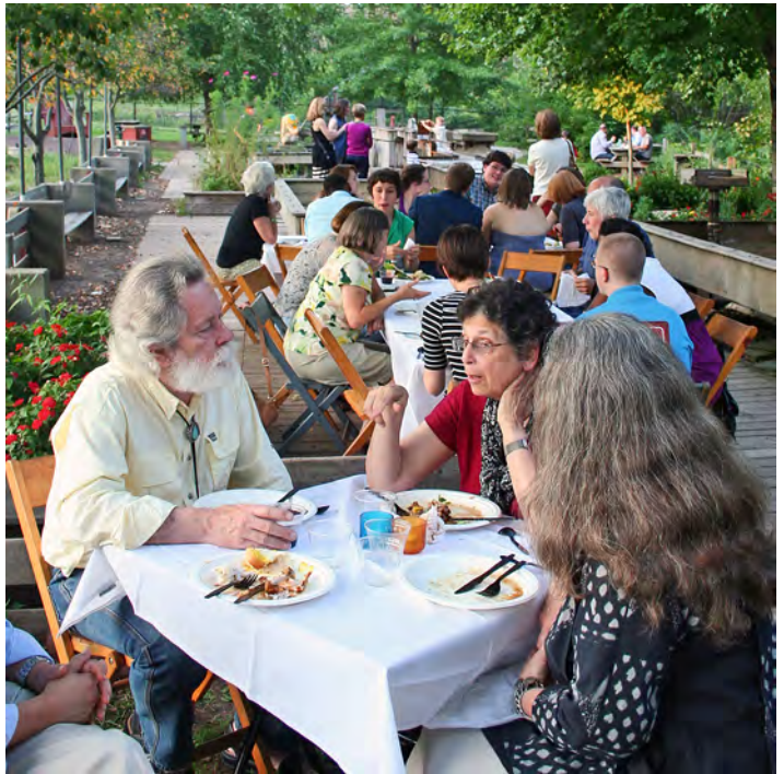
Breaking bread al fresco .

The ISM community celebrated the opening of the academic year at the ISM picnic, held again this year on the grounds of the Eli Whitney Museum in Hamden.