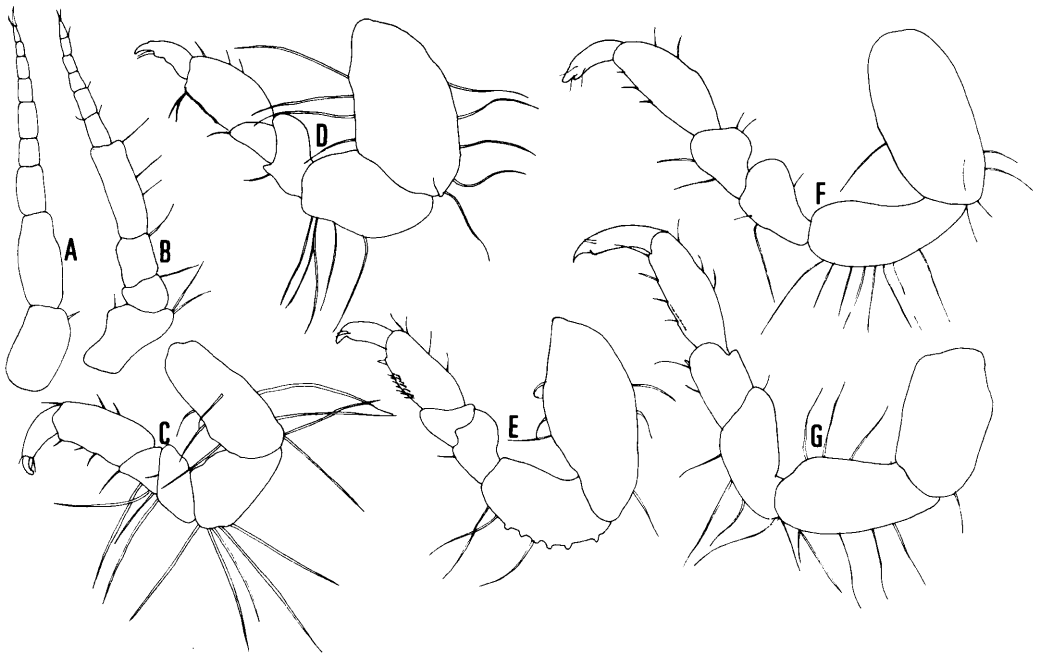
Fig. 3. A specimen considered to be Eisothistos nipponicus , n. sp. A : First antenna. B : Second antenna. C : Peraeopod I. D-E : Peraeopods III-IV (All : A sex indeterminable specimen)

Hitherto, 7 species, as far as I am aware, have been discovered as valid in the genus Eisothistos from various parts of the world. The present new species is most closely allied