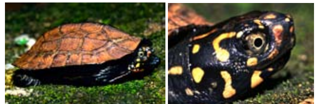
Figure 14. Juvenile Melanochelys trijuga thermalis from Gampola, Sri Lanka.

Indus River near Thatta, Sindh Province). Although this record is disregarded by most authorities, and the turtle has not been recorded in Pakistan since, the discovery of the species from adjacent Gujarat State in western India (Vyas and Patel 1990) and from the Siwaliks of Sirmaur District of Himachal Pradesh (Pendharkar and Jenner 1994) decreases the known hiatus in its western distribution. This suggests