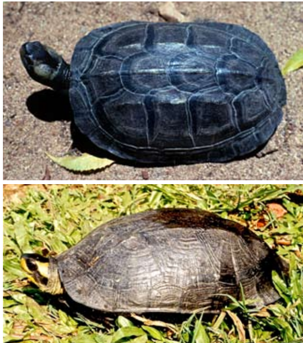
Figure 5. Melanochelys trijuga coronata , (top) adult from Kerala, Tamil Nadu, India. (bottom) adult from Kumarakom, Kerala, India.

a synonym of the subspecies name edeniana (see Fritz and Havaš 2007).