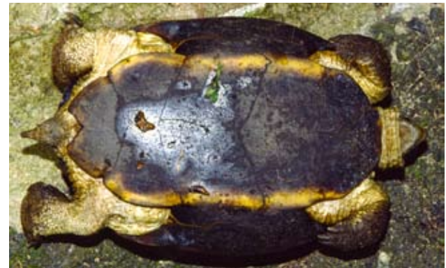
Figure 12. Melanochelys trijuga thermalis , adult female from near Bentota, Sri Lanka.