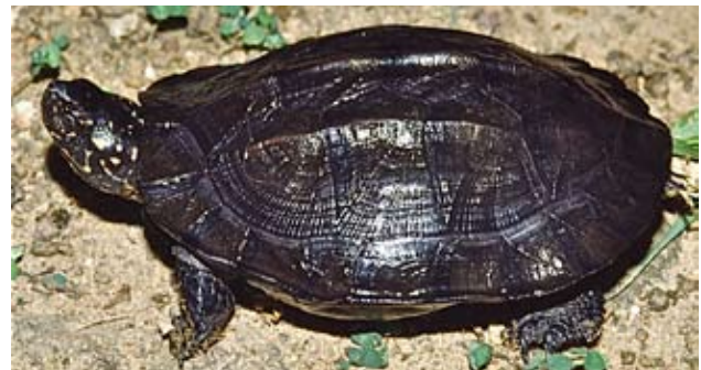
Figure 13. Melanochelys trijuga thermalis , juvenile from near Galle, Sri Lanka.