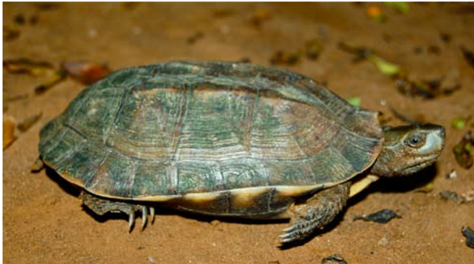
Figure 1. Melanochelys trijuga trijuga from Anaikatti Hills, Coimbatore, Western Ghats, Tamil Nadu, India.

Six subspecies are recognized based primarily on head pigmentation and body size. The subspecies plumbea described by Annandale (1915) is apparently based on trijuga – coronata intergrades. Intergradient populations of the two subspecies have been reported to occur along the ranges of the Western Ghats (see Das and Pritchard 1990).