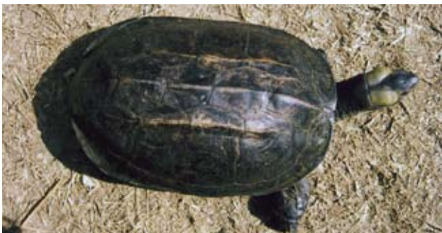
Figure 9. Melanochelys trijuga indopeninsularis from Rupa Lake, Pokhara, Nepal.

Melanochelys trijuga coronata has a CL up to 26.0 cm, and a yellow head with a gray-black diamond-shaped mark on the forehead. The plastron is completely unpatterned black in adults, but not in juveniles.