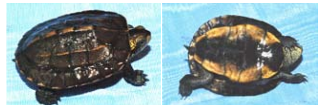
Figure 6. Melanochelys trijuga coronata , hatchling without data, photos by Hans-Dieter Philippen.

Description. — The carapace is elongated, relatively more elevated in adults and more depressed in juveniles, and tricarinate with feebly serrated marginals posteriorly. The nuchal scute is small and distinctly triangular. An interesting feature of the carapace is the octagonal second neural, a condition more frequently found in turtles showing megacephaly (see Pritchard 1988), and in this species may have been acquired from a comparatively more terrestrial ancestor. The plastron is about as long as the carapace, and truncated anteriorly.