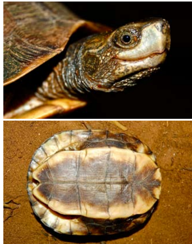
Figure 3. Melanochelys trijuga trijuga , adult female (top) and juvenile (bottom) from Anaikatti Hills, Coimbatore, Western Ghats, Tamil Nadu, India.