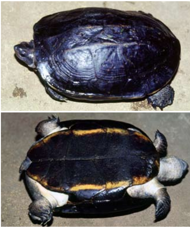
Figure 7. Melanochelys trijuga edeniana from Myanmar.

The head is moderate in size, with a short snout, which is shorter than the diameter of the eye. The upper jaw is notched; the ventral aspect of the jugal is narrow and separated from the pterygoid by the maxilla. The toes are fully webbed. The carapace is typically brown, whereas the plastron is usually brown with a lighter rim. The limbs can be gray, brown, or blackish. The nominotypical subspecies has pale yellow reticulations on the head, especially on the temporal region. The recognized subspecies are defined by differences in size and coloration.