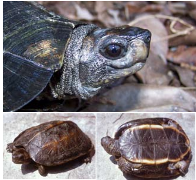
Figure 8. Melanochelys trijuga edeniana , (top) adult female from Myanmar; (bottom) juvenile from the market in Ruili, Yunnan, China.

Melanochelys trijuga edeniana has a CL up to 28.0 cm, and the head is uniform gray or brown, or with indistinct yellow reticulations that may be absent in older individuals.