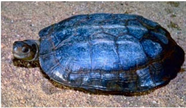
Figure 11. Melanochelys trijuga parkeri from Sri Lanka.

study reported that in both subspecies, males were larger and heavier than females and the populations had female-biased sex ratios. Adult males possess concave plastra and comparatively thicker tails than females.