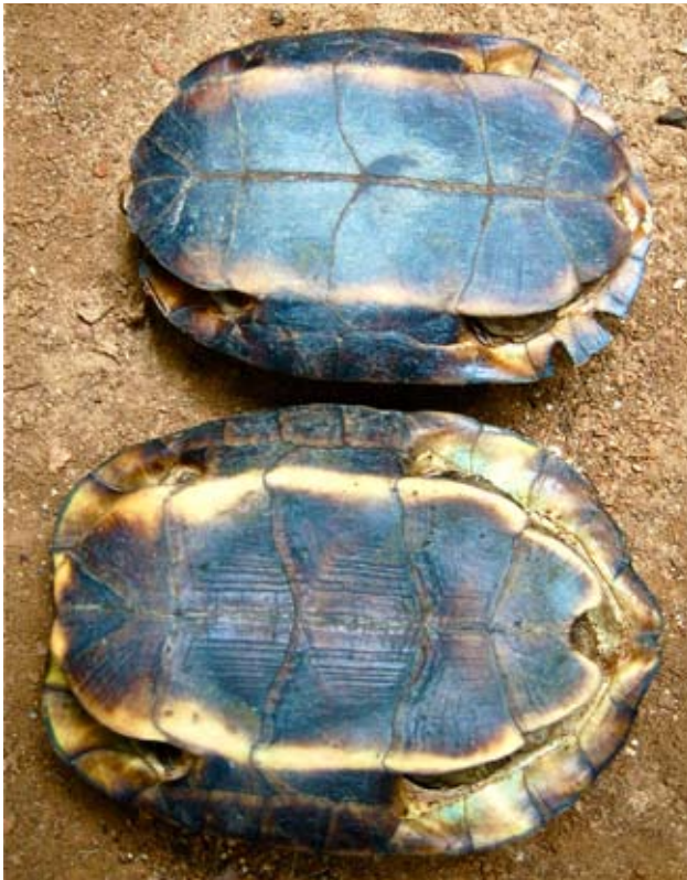
Figure 2. Melanochelys trijuga trijuga , adult female (top) and adult male (bottom) from Anaikatti Hills, Coimbatore, Western Ghats, Tamil Nadu, India.

The name wiroti was made nomenclaturally available in a book by Nutaphand (1979), although the authority to the specific epithet was attributed to Reimann. Since Reimann's description of the taxon was never published, the name should be attributed to Reimann in Nutaphand 1979 (Obst 1983). The taxon was apparently founded on a juvenile purchased from a market on the Thailand–Myanmar border (see Thirakhupt and van Dijk 1994), and is currently