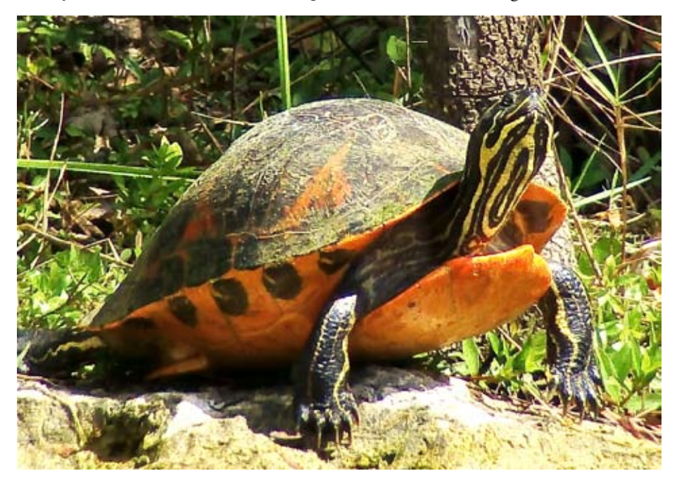
Figure 1. Pseudemys nelsoni, adult female from Big Cypress National Preserve, Collier County, Florida.

(1894) assigned specimens from north-central peninsular Florida to Pseudemys rubriventris ; subsequently, De Sola (1935) referred the Everglades population to Pseudemys alabamensis . Although some later authors (e.g., Mertens