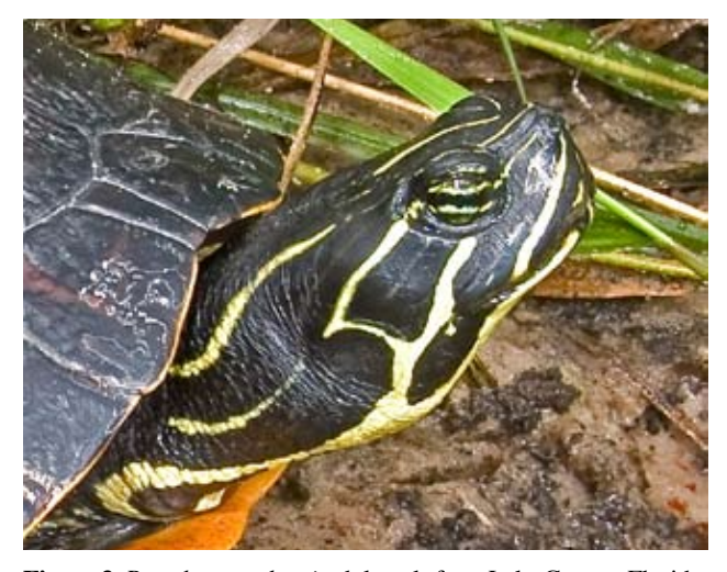
Figure 3. Pseudemys nelsoni , adult male from Lake County, Florida.

Most authorities agree that the three species of redbellied turtles — Pseudemys alabamensis , P. nelsoni , and P. rubriventris — form a closely related group, the rubriven tris series (Seidel 1994; Stephens and Wiens 2003). Dobie