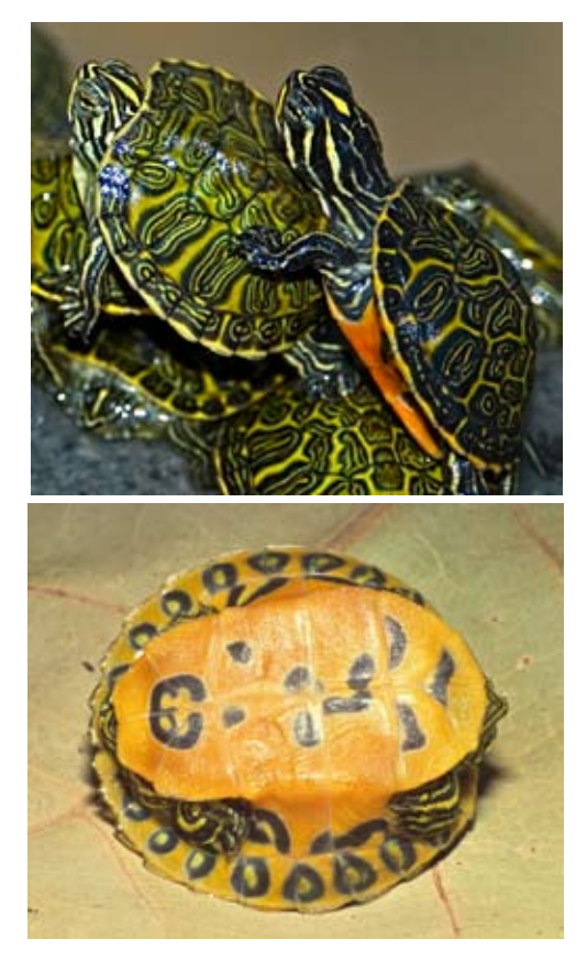
Figure 4. Pseudemys nelsoni, hatchlings from Florida.