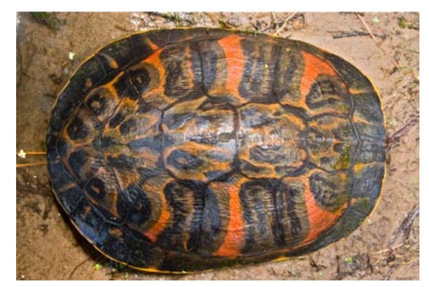
Figure 2. Pseudemys nelsoni, adult male from Marion County, Florida.

1951; Crenshaw 1955) considered nelsoni to be a subspecies of one of those two species, most have followed Carr. The species was included with all other Pseudemys in McDowell's (1964) expanded genus Chrysemys , but most current workers now reject that allocation. No subspecies of P. nelsoni are recognized, although geographic variation has not been examined.