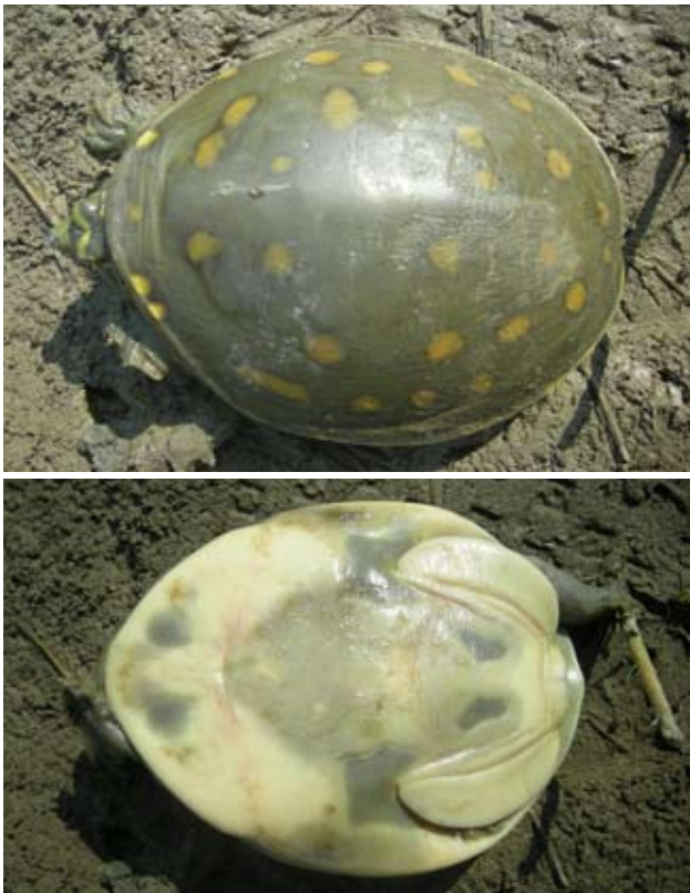
Figure 7. Subadult Lissemys punctata andersoni , Ghaghra River, northern India.

(Auffenberg 1981). The carapace is relatively humped and smooth-surfaced in juveniles and adults, but hatchlings have low, indistinct ridges of tubercles, most prominent along the lateral margins. Das (1991) reported the young to have granules forming longitudinal folds. Young and adults have a complete marginal ridge (seam paralleling anterior rim of carapace) with little modification in the nuchal region. The antibrachial scalation consists of four to six curved, cusped scales that are distal to the upper marginal completely smooth scale.