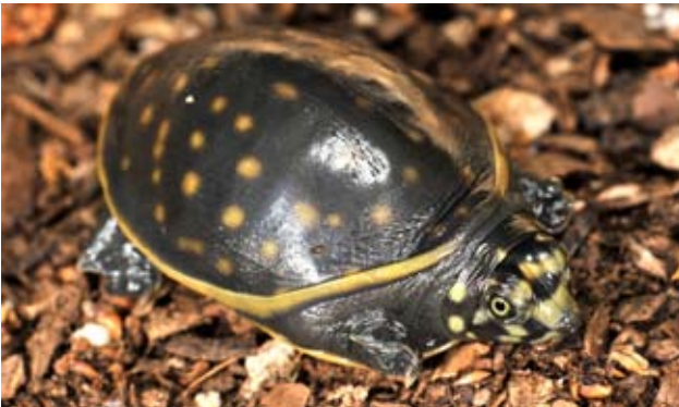
Figure 9. Hatchling Lissemys punctata andersoni .

The carapace shape is nearly circular in hatchlings, more oval in adults. Adult females are larger than males (Auffenberg 1981; Agarwal 1987; Shrestha 1997). The maximal (curved) carapace length (CL) of females is 350