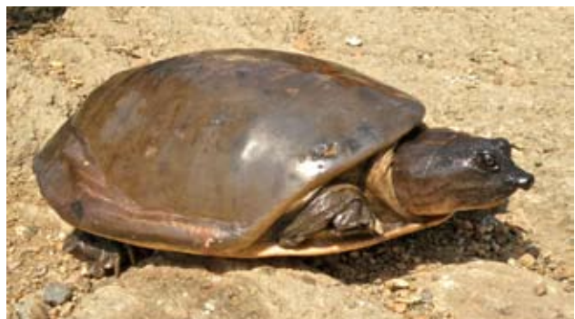
Figure 5. Adult male Lissemys punctata vittata , Mahanadi River, Orissa, India.

Description. — Femoral flaps and nasal septal ridges are present. Shell closure (femoral flaps and moveable anterior plastral lobe) allows for complete concealment of head, neck, and limbs and thus protection from predators and desiccation