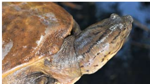
Figure 6. Lissemys punctata vittata , Netravati River, Karnataka, India.