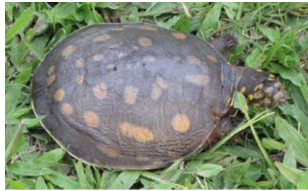
Figure 8. Juvenile Lissemys punctata andersoni , Assam, northeast India.

mm [estimated PL 334 mm] (Bhupathy 1989). Maximal CL size of a sample of 10 males from eastern Uttar Pradesh, India, was 230 mm (Yadava and Prasad 1982). Vyas (1996) recorded average dimensions of six clutches of hatchlings ( n = 40 ) noting the carapace length (CL) mean = 35.7 mm, range = 34.8–37.0 mm and mass, mean = 6.0 g, range = 8.0–10.0 g. Rashid and Swingland (1997) recorded hatchlings with CL = 35–44 mm. Minton (1966) reported a hatchling ( L. p. andersoni from Pakistan, taken 27 July) with a CL = 35 mm.