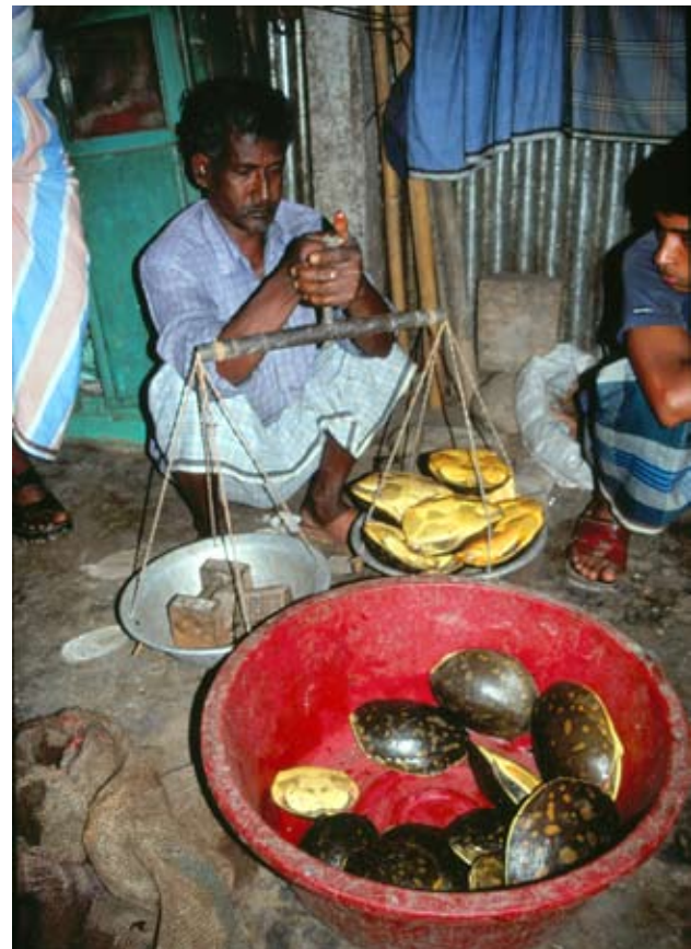
Figure 12. Lissemys punctata andersoni for sale in a market in Mongla, Bangladesh.

Currently, it seems that due to stringent action taken by forest department officials in West Bengal, the state where this species is exploited the most, the turtle trade has either been controlled or gone underground. Gupta (2002) reported that turtle trade originating from northeast Indian states have now been stopped because of the dwindling population of turtles, including L. punctata . However, sporadic reports on the illegal harvest of this species are available in recent years