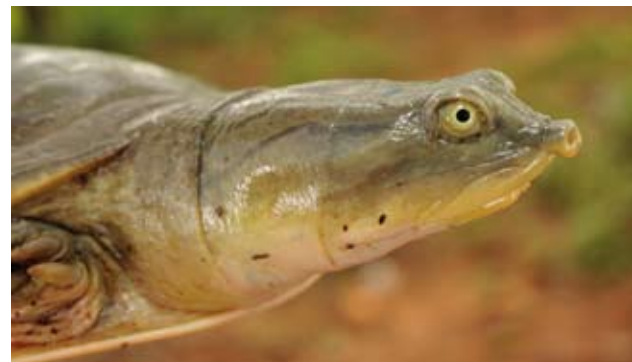
Figure 3. Juvenile Lissemys punctata punctata from Moyar River, Karnataka-Tamil Nadu border, India.

Praschag et al. (2011) investigated the relationships among Asian flapshell turtles using 2286 bp of mitochondrial