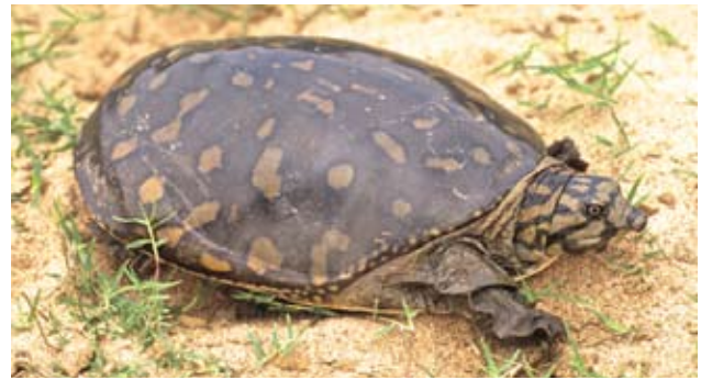
Figure 11. Adult Lissemys punctata vittata x andersoni from Subarnarekha River, Orissa, India (with vittata mitochondrial haplotype).

The diploid chromosome number is 66 (Bickham et al. 1983).