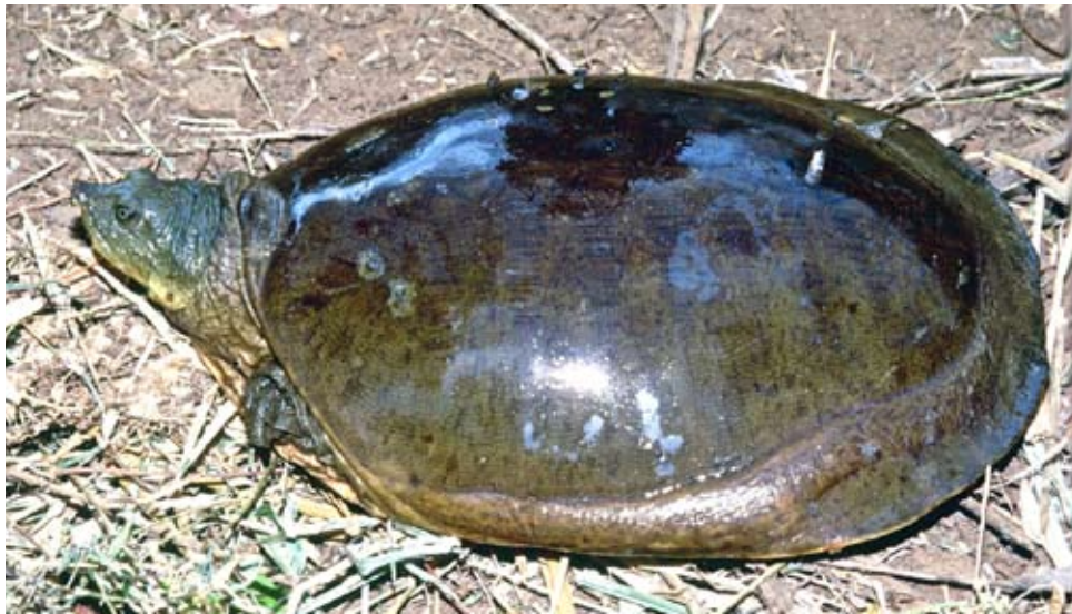
Figure 1. Adult Lissemys punctata punctata from Mamallapuram, Tamil Nadu, India.

in his reiteration of Lacépède's description and copied his illustration, is now regarded as the author of the valid name Lissemys punctata .