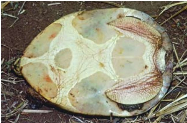
Figure 2. Adult Lissemys punctata punctata from Mamallapuram, Tamil Nadu, India.

The specific status of L. punctata has not been questioned since the original description, but the species has been recognized by several different name combinations. Several authors assigned the species to the genus Trionyx (e.g., Mertens and Wermuth 1955). Gray (1831) proposed Emyda for this species, and Duméril and Bibron (1835) changed both the generic and specific names, using Cryptopus granosus , the specific name stemming from Schoepff's (1801) name Testudo granosa . The name Emyda granosa became entrenched as the name for the Indian Flapshell Turtle in the literature for a while through its use by Boulenger (1889), Siebenrock (1902, 1909), and Annandale (1912). Smith (1931), noting senior homonyms of both Emyda (initially by Baur 1893) and Cryptopus , proposed the new generic replacement name Lissemys and reverted to using punctata as the correct specific name. Some additional information regarding taxonomic history and nomenclature of this species is noted in Webb (1980).