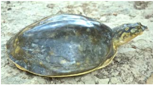
Figure 10. Adult female Lissemys punctata vittata x andersoni from Keoladeo National Park, Bharatpur, Rajasthan, India.

the foramen intermaxillaris and the opening of internal nares). The body of the hyoid consists of three pairs of bones and the posterior horn is not subdivided (i.e., it consists of a single curved element).