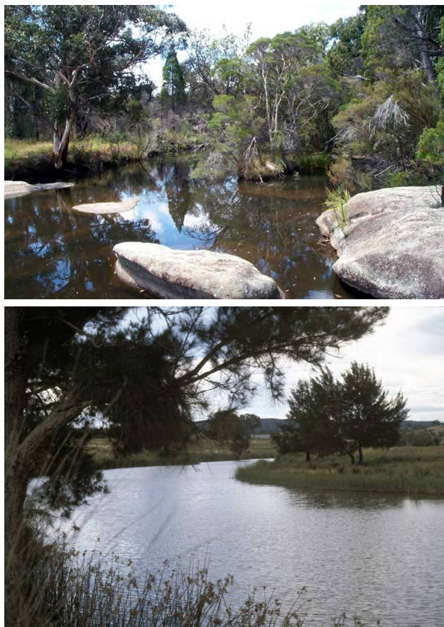
Figure 6. Typical habitat of Myuchelys bellii . Top: Bald Rock Creek, Border Rivers catchment, Queensland. Bottom: Roumalla Creek, Gwydir River catchment, New South Wales.

can last up to 15.5 days. The species is similar to Elseya albagula and Rheodytes leukops in its ability to use aquatic respiration to support prolonged submergences and dives, especially at lower water temperatures, and its crepuscular peaks in activity (Fielder 2012). Myuchelys bellii also hibernates in deep water (>3 m) as an overwintering strategy when ambient water temperatures drop to about 5°C during July (Fielder 2012). Basking occurs throughout the active months when animals emerge fully to bask on granite boulders or protruding logs (Fielder 2012).