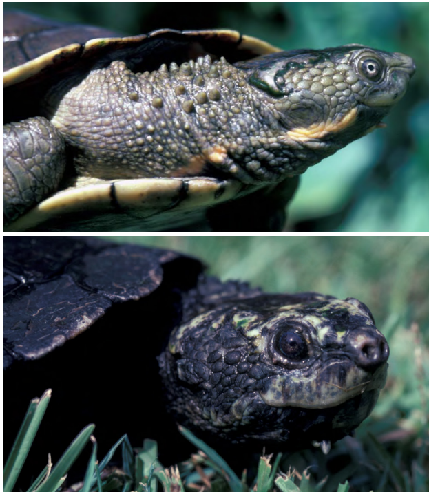
Figure 3. Lateral views of the heads of A: a young Myuchelys bellii and B: an aged individual, both from Roumalla Creek, Gwydir River catchment, New South Wales, Australia. Note the prominent and well-defined head shield with its projection down the parietal ridge toward the tympanum, the enlarged pointed tubercles on the neck and the low rounded tubercles on the temporal region.

Georges and Thomson (2010). Subsequent molecular and morphological assessments have found no substantive genetic (Fielder et al. 2012) or morphological (Fielder 2013) differences among populations from the Gwydir, Namoi, and Border Rivers catchments. They found little evidence to support any taxonomic subdivision of M. bellii at the species or subspecies level, as suggested by Cann (1998:208, 212). Myuchelys bellii and M. latisternum are sister taxa (Fielder et al. 2012; Le et al. 2013).