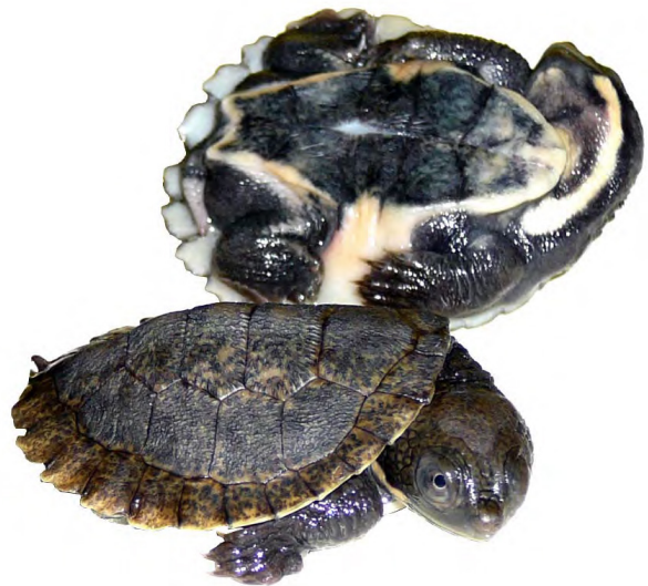
Figure 4. Ventral and dorsolateral views of a hatchling Myuchelys bellii from the Bald Rock Creek, Border Rivers catchment, Queensland, Australia.

Hatchlings almost circular in outline (mean carapace length 26.7 \pm 0.3 mm; mean carapace width 26.8 \pm 0.6 mm, n = 16 ), with moderate serration of the margins