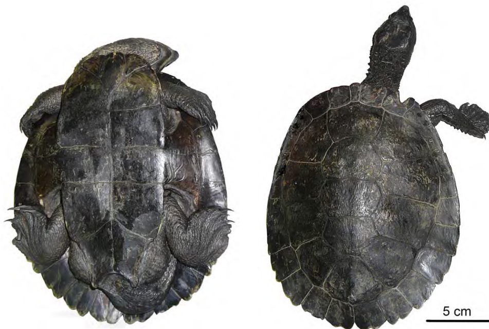
Figure 2. Ventral and dorsal views of male Myuchelys bellii from Bald Rock Creek, Border Rivers catchment, Queensland, Australia.

The generic name Wollumbinia was coined by Wells (2007) to include E. bellii , but appeared in an electronic document without peer review and is of disputed status with respect to the International Code of Zoological Nomenclature (ICZN 1999); we do not regard it as an available name. In any case, we follow the recommendations of Kaiser et al. (2013) and regard the Wells (2007) document as neither a scientific paper ( sensu CBE 1968) nor a publication for the purposes of nomenclature. Thomson and Georges (2009) instead placed E. bellii in the genus Myuchelys , which they separated from Elseya , a classification followed in the revision by