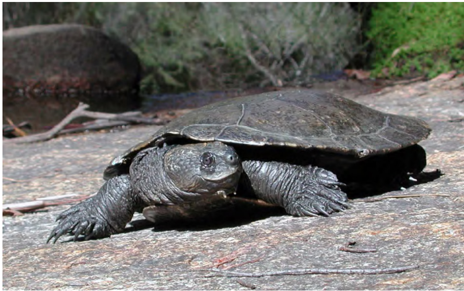
Figure 1. Adult female Myuchelys bellii from Bald Rock Creek, Border Rivers Catchment, Queensland, Australia.

Concurrently, investigative work by Rhodin (unpubl. data) clarified the identity and origin of the holotype of Phrynops bellii , and Cann (1998) provided circumstantial evidence that the type specimen was sourced from the Namoi and Gwydir river systems of Australia. Recent morphometric analyses have also supported Cann's (1998) match with the holotype specimen of Phrynops bellii (Fielder, 2013). The species was first transferred to the genus Elseya by Cann (1998), who also reported the occurrence of a population of similar turtles in Bald Rock Creek in the Queensland portion of the Border Rivers catchment, but was uncertain of its status.