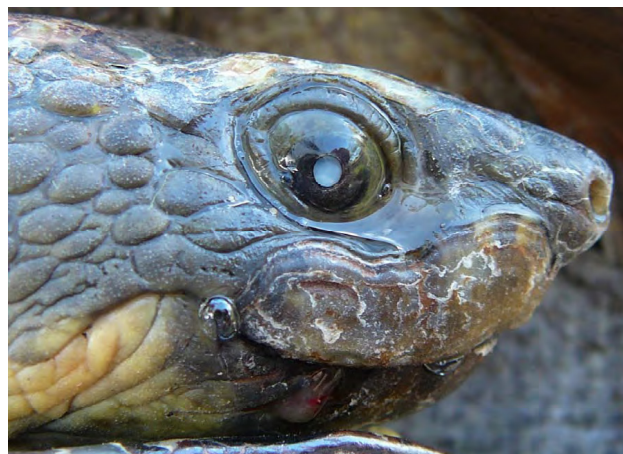
Figure 7. Myuchelys bellii is susceptible to eye diseases such as cataracts, which can lead to blindness.

Threats to Survival. — Myuchelys bellii has delayed age at first breeding, low annual fecundity, and high