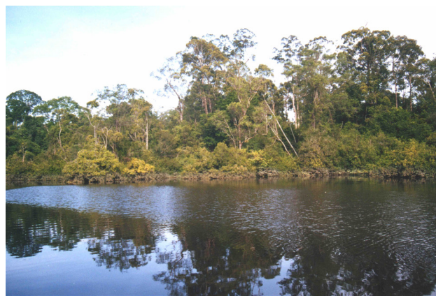
Figure 10. Habitat of Amyda cartilaginea at Loagan Bunut National Park, Sarawak, Malaysia (Borneo).