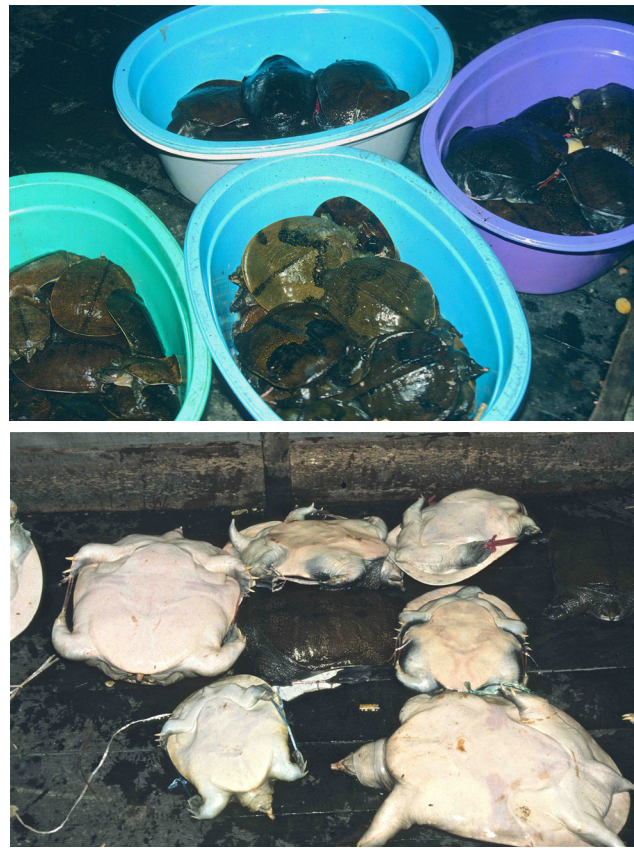
Figure 13. Amyda cartilaginea and Dogania subplana collected for the consumption trade in Sambas, West Kalimantan, Indonesia.

Incubation Period. — Reported incubation periods are variable. Jasmi (1986) reported that five hatchlings in Malaysia emerged from a clutch of 28 eggs after 61 days in a styrofoam box at ambient temperature. However, natural nests appear to take longer. Eggs collected from nesting sites in Bangkok took 74 days or more to hatch at 28°C (Kitana 1997) and a clutch observed by Kopstein (1929) hatched after 78–85 days. Kopstein (1938) also reported on two clutches that hatched after 135 and 139 days, and Bourret (1941) reported that incubation lasts as long as 135–140 days. In artificially incubated clutches, hatching was observed between 95 and 102 days (Susanti 2013).