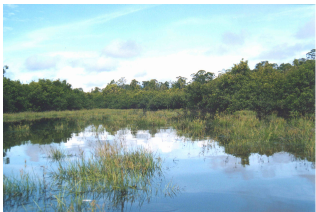
Figure 9. Amyda habitat from Loagan Bunut National Park, Sarawak, Malaysia (Borneo).