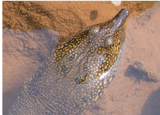
Figure 3. Adult Amyda cartilaginea , Dokhtawady River, Myanmar.