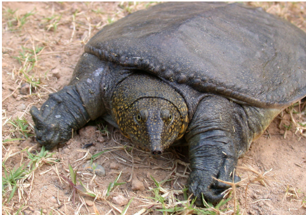
Figure 2. Adult Amyda cartilaginea , Dokhtawady River, Myanmar.

for the purposes of this conservation biology account. Their genetic analyses have suggested the existence of three major clades within the complex. Using the sister group of Amyda , Nilssonina , as a yardstick, the authors argued for the recognition of three species: an unnamed form from the north coast of Borneo, A. cartilaginea restricted to the islands of the Sunda shelf, and A. ornata , which they resurrected for the mainland forms. Within A. cartilaginea they recognized two subspecies, the nominal form A. c. cartilaginea from Java and the southeast side of Borneo, and a new subspecies, A. c. maculosa Fritz, Gemel, Kehlmaier, Vamberger, and Praschag 2014 from Sumatra and western Borneo. This new subspecies is the "saddle-blotched" form recognized by previous authors (Smith 1931; van Dijk 1992; Auliya 2000) (see Figs. 5 and 8). This pattern was also observed in specimens from northern Borneo (K. Jensen, in litt. to Auliya, 2015): "all except three of the 26 live specimens photographed [from