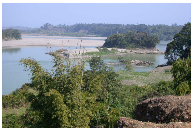
Figure 11. Habitat of Amyda cartilaginea , the upper Chindwin River, Myanmar.