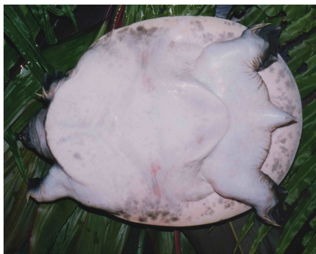
Figure 6. Adult Amyda cartilaginea , Loagan Bunut National Park, Sarawak, Malaysia (Borneo).

The carapace of this species usually consists of 9 neural bones, with the first two fused, and 8 pairs of costals with the last pair unreduced (Meylan 1987). In addition to the standard trionychid pattern of pits in the carapacial bones, small individuals of Amyda also show a rather distinctive presence of a few sinuous longitudinal bony ridges stretching across several pleural bones. The plastron has five (sometimes poorly developed) callosities and very