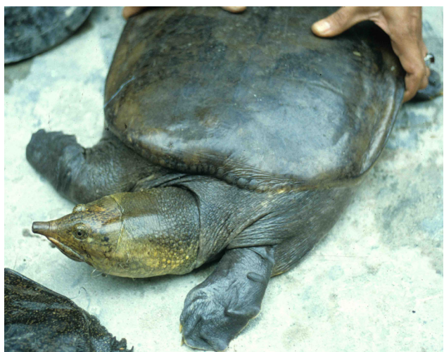
Figure 5. Adult Amyda cartilaginea , Anjungan, West Kalimantan, Indonesia.

Amyda ornata (Gray 1861) has priority for the mainland species level clade recognized by Fritz et al. (2014). Within this clade, the authors recognized three subspecies: the nominal form, A. o. ornata , from Laos and Cambodia; A. o. phayrei , new combination, for the form that is so far known from Thailand, Myanmar, and trade material from Yunnan; and a currently unnamed form from Bangladesh. These authors correctly argued that their work should increase conservation concern for A. cartilaginea ( sensu lato ) as it actually represents multiple taxonomic entities. However, incomplete geographic sampling in key areas and the likelihood of further taxonomic adjustment suggest that full incorporation of this developing taxonomy into this account would be premature.