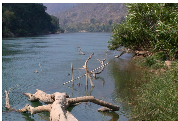
Figure 12. Habitat of Amyda cartilaginea , Dokhtawady River, Myanmar, with a local Amyda trap (*).

elongated streaks (Fig. 1 in van Dijk 2000). Limbs usually bear fewer distinct spots.