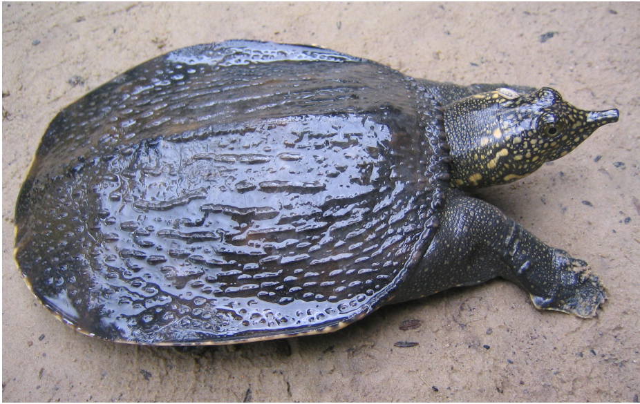
Figure 1. Subadult Amyda cartilaginea from the Cardamom Mountains, southwest Cambodia.

in Geoffroy Saint-Hilaire 1809, cariniferus Gray 1856, ornatus Gray 1861, phayrei Theobald 1868, jeudi Gray 1869 (see Anderson 1871), and nakornsrihammarajensis Nutaphand 1979.