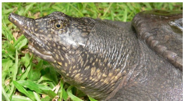
Figure 4. Adult Amyda cartilaginea in captivity in Java, Indonesia.

northern Borneo] had a saddle shape of black spots on the forward area of the carapace. Those with saddles also had a medial, black streak near the posterior of the carapace and circles or blotches near the margins made of smaller black spots. These patterns could also be seen on the preserved specimens from the Sarawak Museum. All but one of these animals had the black saddle, black streak near the posterior of the carapace and the circles of blotches on the carapace.”