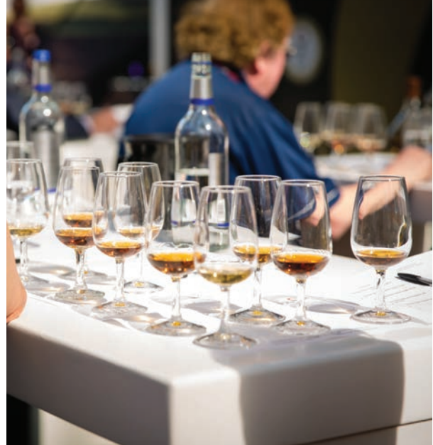
Spirits tasting at the London Wine Fair