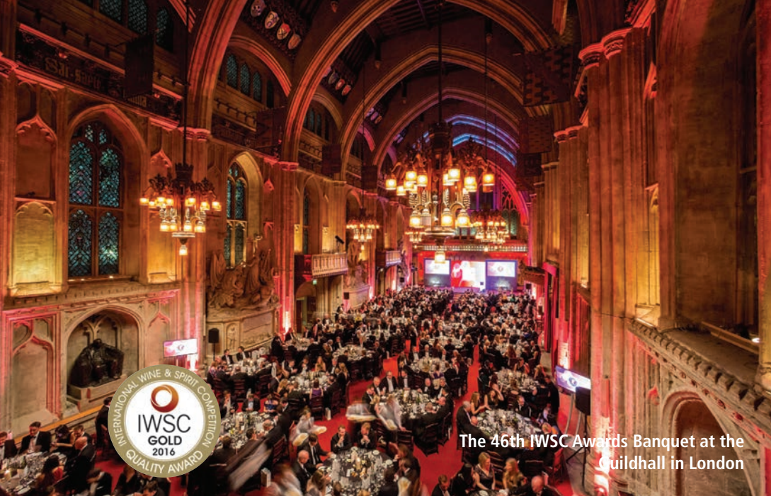
The 46th IWSC Awards Banquet at the Guildhall in London