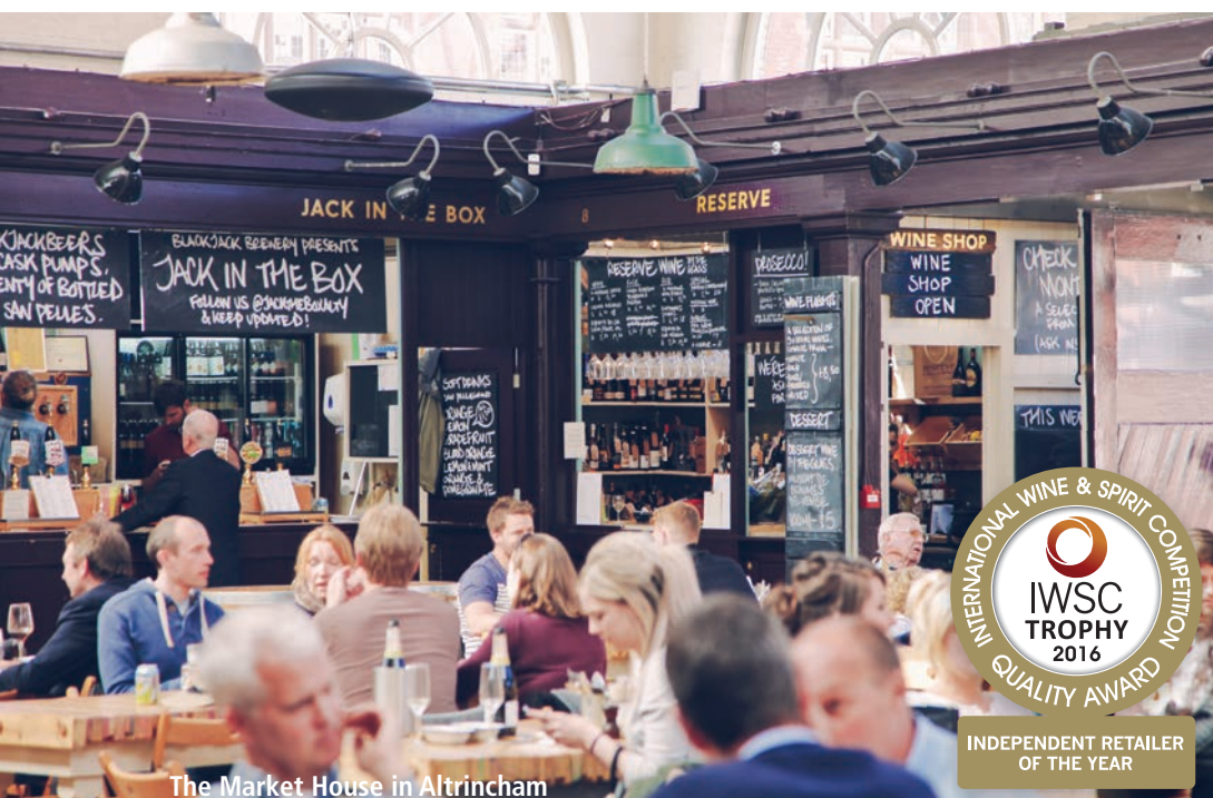
The Market House in Altrincham