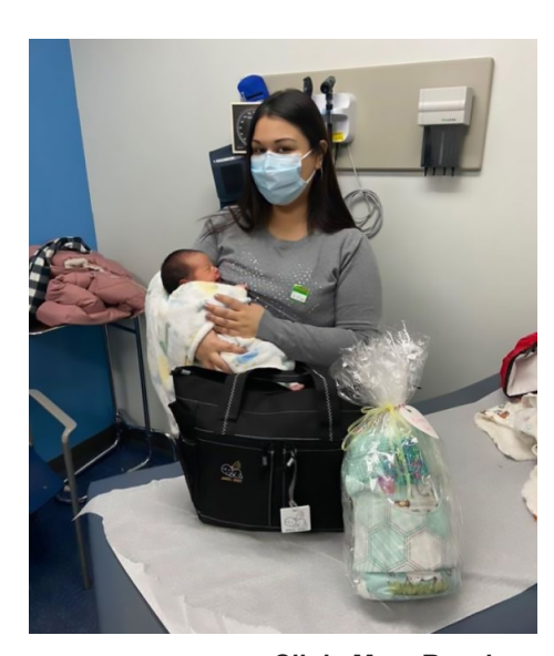
Clinic Mom Receives Auxiliary AngelBaby Bag