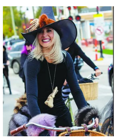
Clarendon Hills Chapter Witches Ride