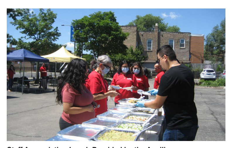
Staff Appreciation Lunch Provided by the Auxiliary