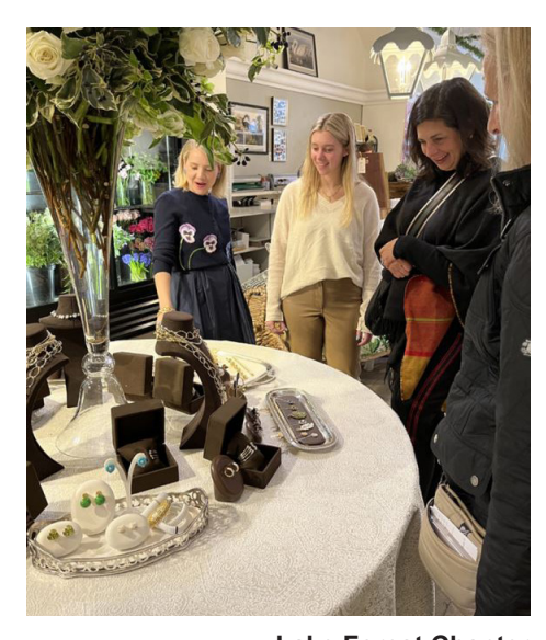
Lake Forest Chapter Shopping Night Event