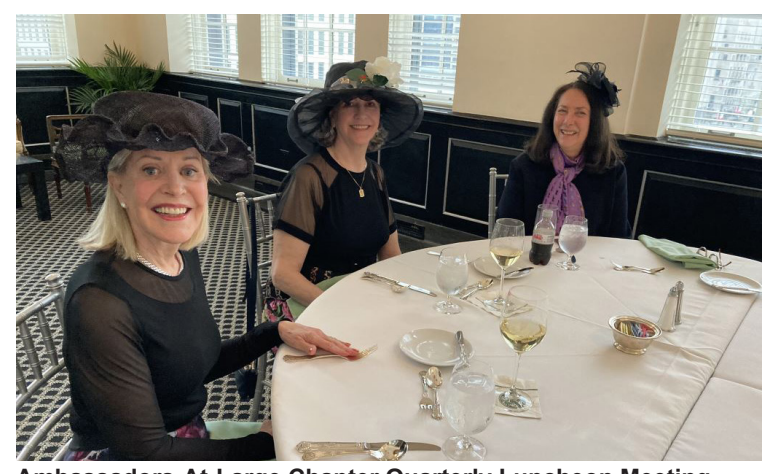
Ambassadors-At-Large Chapter Quarterly Luncheon Meeting