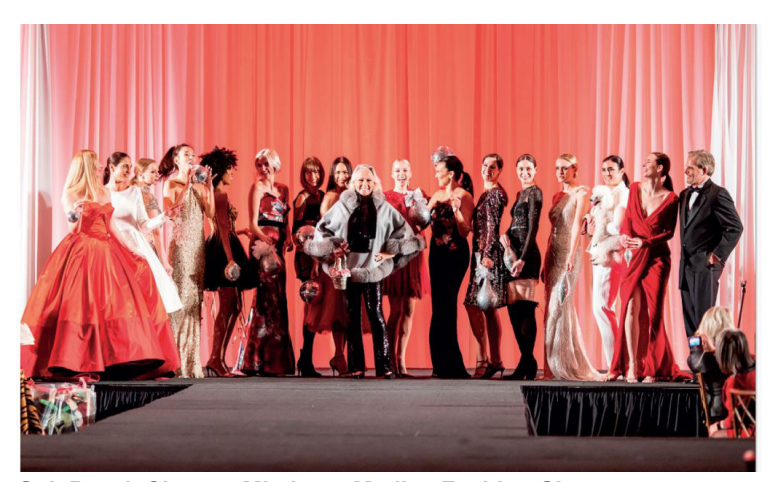
Oak Brook Chapter Mistletoe Medley Fashion Show