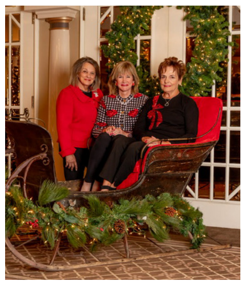
Oak Brook Chapter Mistletoe Medley Luncheon-Fashion Show