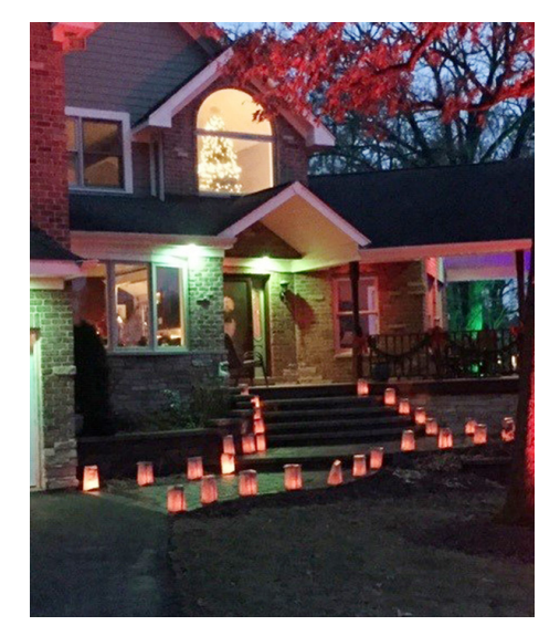
Clarendon Hills and Wheaton-Naperville Chapters Luminaria