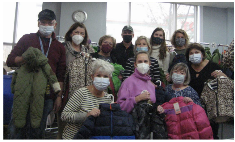
Annual Auxiliary Coat Drive