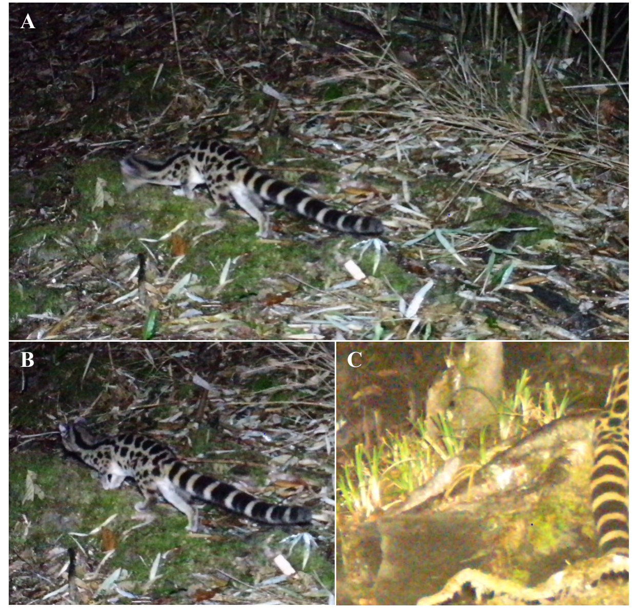
Figure 2: Camera-trap images of the Spotted linsang Prionodon pardicolor from the Tashigang Forest Division, recorded in 2014–2015 (a, b), and 2020 (c).

In Bhutan, P. pardicolor is so far known from only few locations, most commonly in the western region. During a tiger inventory in the Jigme Dorji National Park (2011–2012) in northwestern Bhutan by Thinley et al. (2015), a single image of P. pardicolor was recorded at elevations between 2,063 and 4,105 m a.s.l. in mixed-conifer forests. Later, during the NTS (2014-2015), the species was recorded at two different locations in the Gedu Forest Division in southwestern Bhutan, at elevations between 2,150 and 2,718 m a.s.l. in cool broadleaf forest with sparse stands of Rhododendron arboretum (Dhendup and Dorji, 2018). These findings indicate that cool broadleaf forest and mixed conifer montane forest of Bhutan support significant habitat niches for such rare species and important wildlife corridor to the larger landscape of the eastern Himalayas.