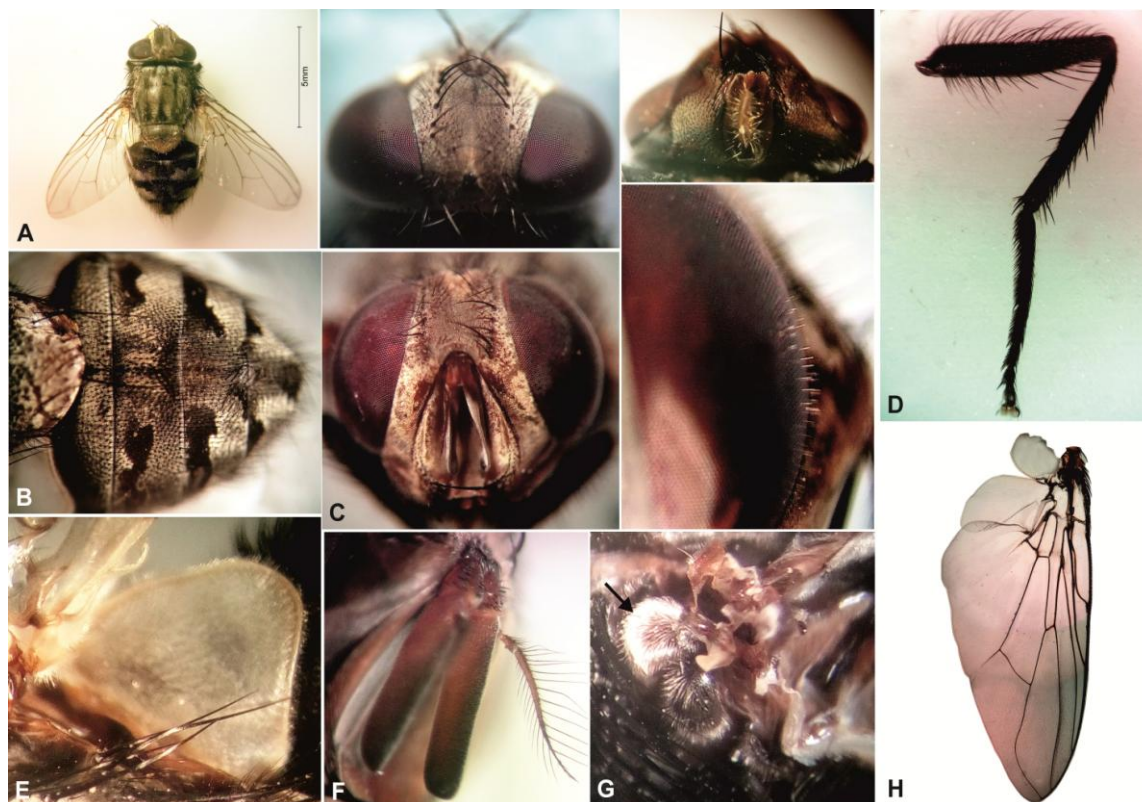
Figure 1: Diagnostic morphological characteristics of adult Passeromyia heterochaeta ; General body shape from above (A), shifting tessellated pattern of abdomen and scutellum (B), head: clockwise including anterior, and dorsal view (parafrontalia), ventral view (parafacialia) with lighter pruinose, varying from brown through golden to silvery white, and haired compound eye, respectively (C), ciliated hind tibiae and bristled femora (D), squamae (E), third antennal segment not reaching the border of the mouth (F), epaulet orange (arrow) (G), and wing venation pattern (H).