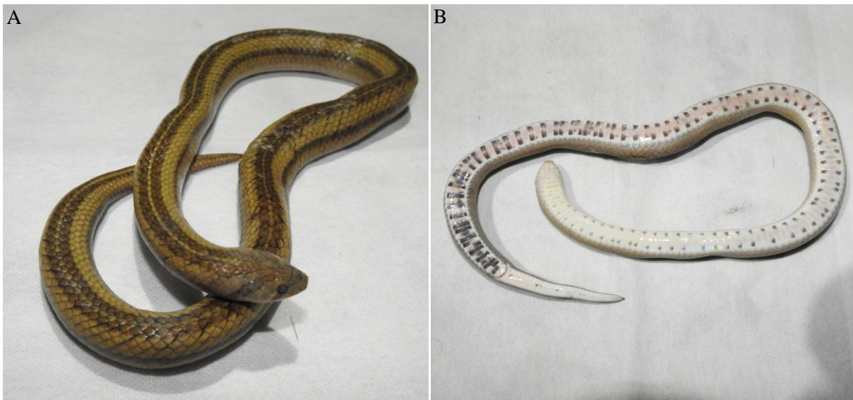
Figure 3: Dorsal (A) and ventral view (B) of Oligodon cyclurus recorded from Ranjani village, Morang, Nepal.