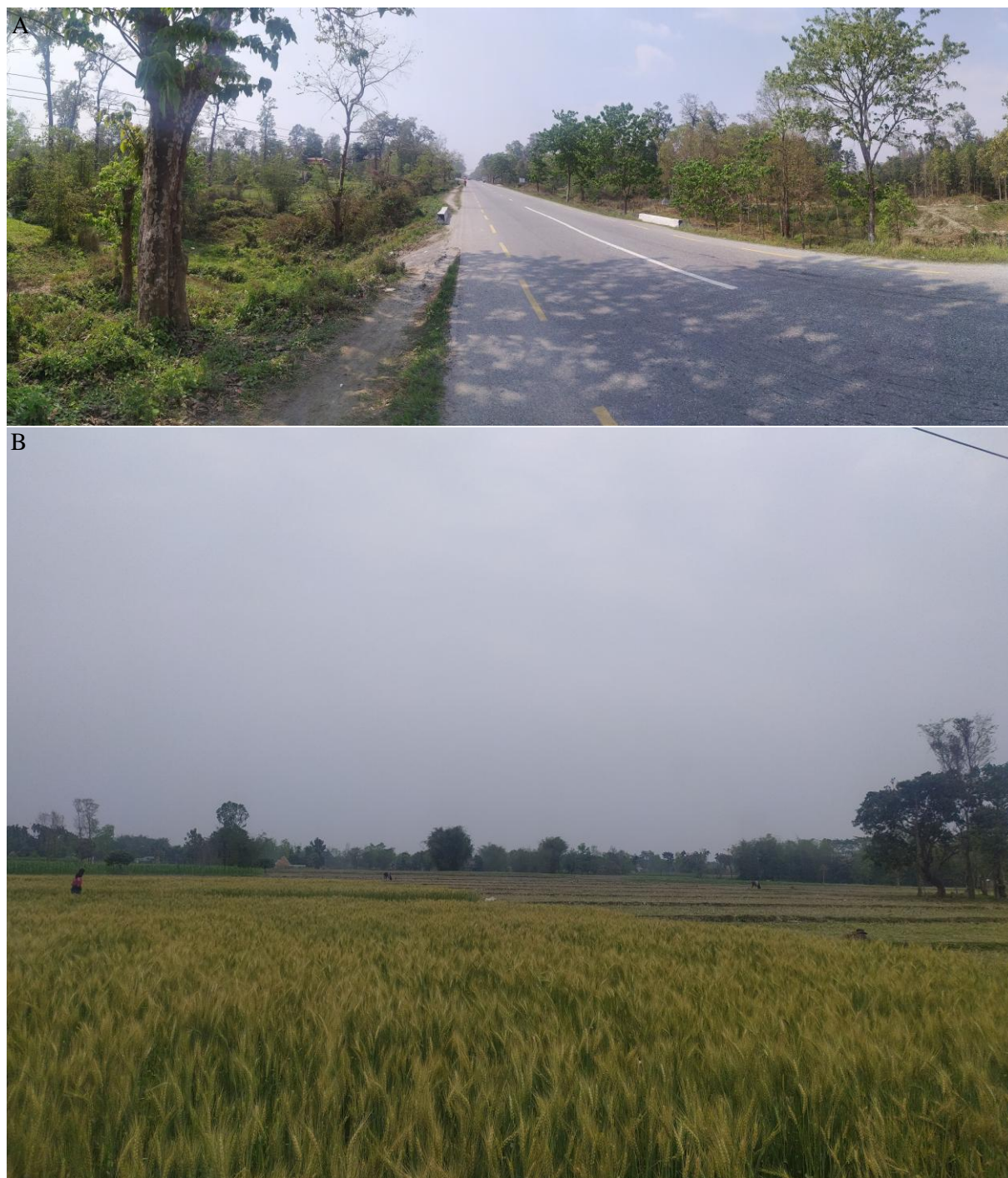
Figure 4: Habitats of two recorded specimens of Oligodon cyclurus in Morang, Nepal (A and B).

comments and suggestions. We also thank Netra Koirala for his field assistance and Sandhya Sharma for map preparation.