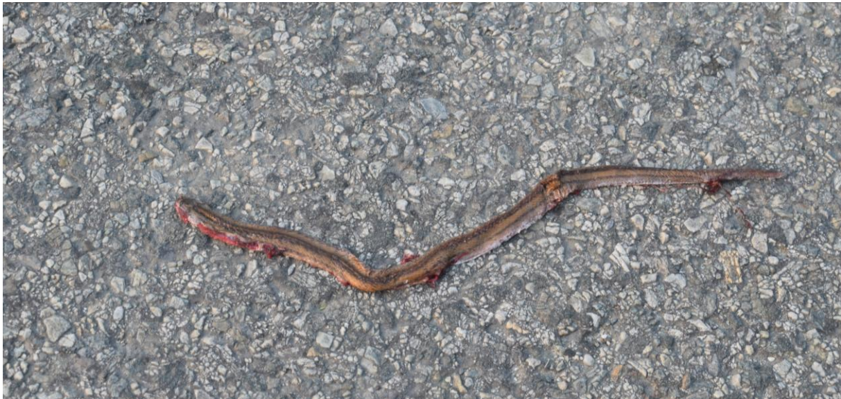
Figure 2: Road-killed specimen of Oligodon cyclurus recorded from Pathari-Kanepokhari road segment, Morang, Nepal.

mm; MSR 19; VS 168; SC 36 (divided); SL 8 (4 th and 5 th in contact with the eye); EyeL 3 mm; IOD 7 mm; IND 6 mm; PrO 2; and PtO 2. The cream-colored vertebral streak ran from the base of the head to the tail tip. The ventral scales exhibited black dots which were more prominent towards the posterior end. However, such dots were absent in the subcaudal scales (Figs. 2 and 3).