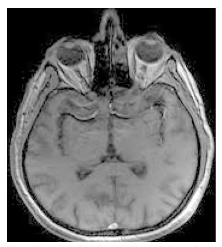
Figure 4. Lacrimal gland and all intraorbital tissues look normal in day 7 magnetic resonance imaging image.