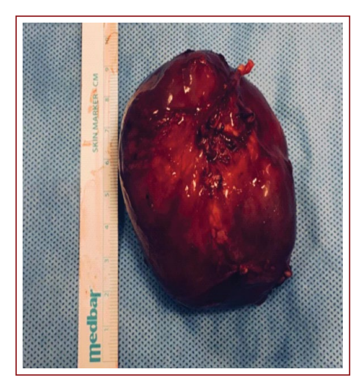
Figure 3. Total excision of the mass.

terone level was measured as normal at 648.3 pg/mL (50-1750 pg/mL). Thereupon, amlodipine 0.5 mg/kg/day was started and close blood pressure monitoring was started. The high blood pressure detected in the patient was attributed to the compression of the aorta by the left renal mass. Amlodipine treatment was discontinued when blood pressure values were found to be normal in the postoperative period. In the patient's follow-up, blood biochemistry values, complete urinalysis and urine culture results were found to be normal.