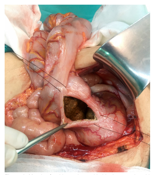
Figure 3. Massive fecal impaction resided in the rectosigmoid on opening the bowel.

proximal sigmoid colon used to fashion the loop colostomy. A full-thickness biopsy was taken from the anorectal junction. The postoperative course was uneventful. The pathological report of the biopsy revealed the nerve plexuses with ganglion cells. The measurement of colonic transit time was performed with radiopaque markers, and the result of the test was within the normal limit. The presence of the rectoanal inhibitory reflex was demonstrated, which excluded Hirschsprung's disease. An improvement occurred in bowel diameter in time. The colostomy was closed after intraoperative colonoscopy revealed normal findings.