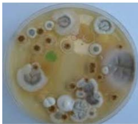
Figure 1: Petri dish contaminated with fungi isolated from (Al Zahraa and Al Qadisiyah campus).

It has been shown through the results that isolated fungi cause disease for humans, for example Alternaria alternata fungus causes skin lesions and inflammation of the internal eye after eye surgery; also, the genus Alternaria dianthicola causes injuries under the skin, as for fungus Cladosporium herbarum , it has been recorded that this type might cause the occurrence of inflammation of keratinized energy, and Penicillium spinulosum fungus it caused neuromuscular inflammation with bronchitis, and the fungus Aspergillus niger caused external ear injuries [30, 31].