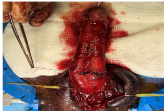
Figure 4: The cavernosal injury was repaired in an interrupted fashion using 3-0 PDS suture.

At the time of operation, a subcoronal circumcising incision was made and the penis was degloved. After evacuation of a large hematoma (Figure 2), a significant defect was identified in the left corpus cavernosum. The defect was ventral in location though lateral of midline. Additionally, a large injury involving the ventral half of the urethra was identified (Figure 3). A 16 French catheter was introduced through the meatus, maneuvered across the defect and into the bladder. The urethra was then closed in a watertight fashion over the catheter using 4-0 Vicryl suture. The cavernosal injury was repaired in an interrupted fashion using 3-0 PDS suture (Figure 4). A circumcision was then performed and the skin edges were reapproximated using interrupted 4-0 Vicryl suture. The urethral catheter was left in place for 4 weeks and then removed.