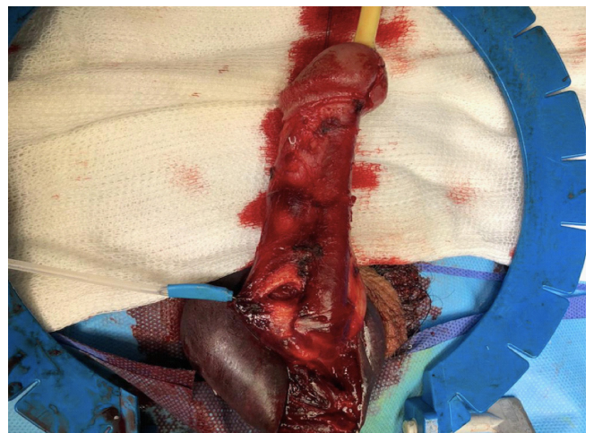
Figure 5: Injury of the right corpus cavernosum.

evacuation of a large hematoma a defect was identified in the right corpus cavernosum, without urethral damage (Figure 5). The cavernosal injury was repaired in an interrupted fashion using 3-0 PDS suture.