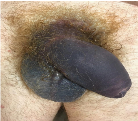
Figure 1: Swollen, ecchymotic penis.