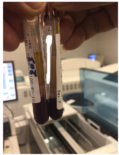
Figure 2: picture showing the grossly lipemic serum while sending the venous blood to be analyzed.

electrolytes replacement in treatment of diabetic ketoacidosis. One limitation was the non-availability of screening for lipoprotein lipase.