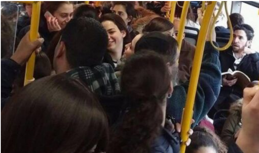
Figure 2: Crowded bus

minutes before a bus arrives, and unlike in West Jerusalem, schedules are not available at the bus stations. Another teen explained that bus drivers do not always care if there are 20 people standing on the bus, and they are all squeezed together, which leads to “inappropriate closeness” with men and boys on the bus. Beyond public transportation, other topics discussed as problems faced by Palestinian youths in Jerusalem included Israeli soldiers; traffic in Shu’fat refugee camp; the rigid education system; the lack of interactive activities during the school year; the lack of facilities in schools, particularly modern science labs; the lack of neighborhood libraries; checkpoints; and, as labeled by the Palestinian teens, the “apartheid wall.”