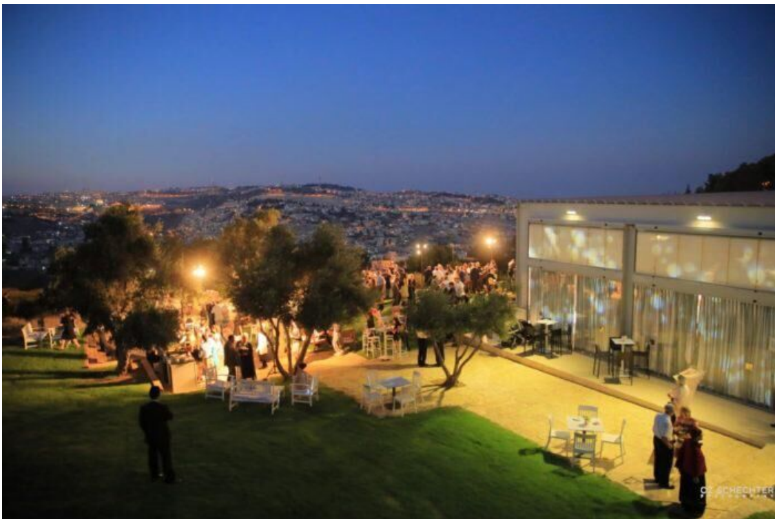
Figure 6: : Picture of the Mixed safety group – Vision for a shared space

The solutions of the mixed youth group, which was made up of Kids for Peace teenage participants, also focused on checkpoints, violence against women and girls, and cleaner streets. The teens noted that “in an ideal world, checkpoints should not exist, and people should have the freedom to move. But until that happens, more checkpoints should be opened, so I do not have to stand for hours waiting at the only one available in my area.” Violence against women was an issue that touched everyone. As noted by the participants: “Women and girls have to feel like they are not alone. We share the responsibility to put a stop to this violence. It is not something we can’t do.” Finally, regarding the trash in the streets, according to the participants, the municipality should put more trash cans in East Jerusalem’s streets, so people can use them and keep the streets clean. Solutions to smelly Jerusalem and the adding of garbage bins were pointed out by several groups in both East and West Jerusalem.