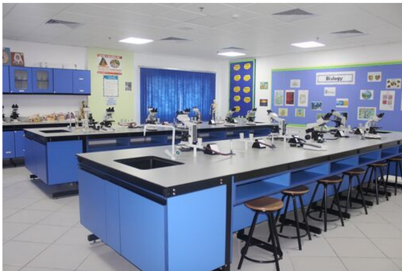
Figure 5: Picture of the Palestinian Youth group.

All the Palestinian, Israeli, and mixed groups came up with ideas for improving Jerusalem and their visions for the future. The facilitator(s) for each group asked them to select the three most important solutions or visions for the future in Jerusalem. The first solution of the Palestinian youth group made up of teenage girls was the removal of checkpoints and the separation wall. The teen participants' vision for the future was the right to see green trees on their way to school, rather than grey walls. The second solution was public transportation where screens should display bus arrival times and any delays. As noted by one participant: "I just want to see a digital screen that shows the time my bus will take to arrive, just like on the Israeli side." The third vision was the creation of scientific laboratories in East Jerusalem schools (Figure 5). As noted by one participant, "Having a modern science laboratory at school would allow me to practice science and not see it only as theory. Maybe I would become a scientist one day."