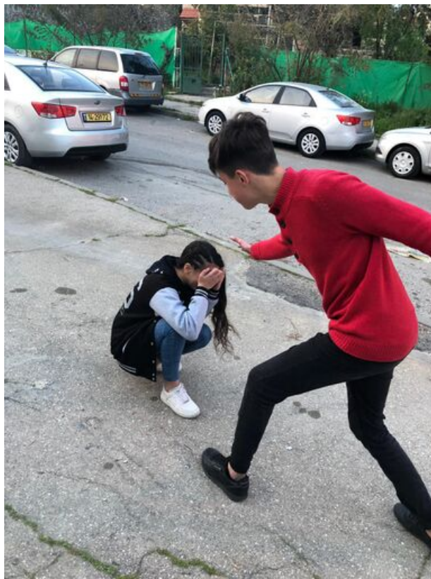
Figure 3: Picture of the Mixed youth group: “If you think this only happens in the movies you are not living in Jerusalem. As an adolescent living in Jerusalem”

enough spaces for young people to go to hang out in the city. Hence, many young people hang out on the streets and drink, which results in violence. Israeli girls also pointed out the lack of sport for women and girls. According to one participant, there are no football teams for women in Jerusalem, not in schools and not in other places: “we deserve to have the opportunity to play on a football team, just like men.” The mixed youth group pointed to many problems in Jerusalem including the following: violence, the hatred of others, violence against girls and women (Figure 3), traffic and public transportation, pollution, the destruction of property, and protests that harm the population.