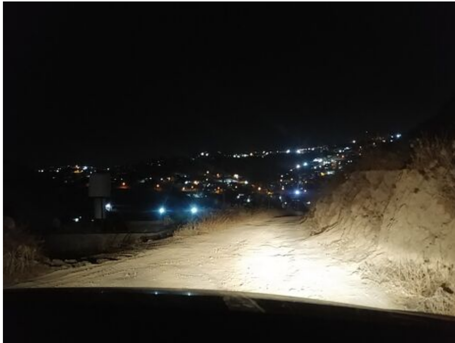
Figure 4: Picture of the Palestinian safety group, a road in East Jerusalem: “Many roads without pavement and lightening at night, we don’t feel safe at all to walk there”

Palestinian women feel uncomfortable. The Palestinian women also expressed the fear that they will be mistakenly targeted by security forces and shot. Regarding safety and protection, the Israeli women’s group also expressed a fear of the soldiers in the streets, attacks by violent perpetrators, items in the street that might be explosives, and unlighted public spaces in Jerusalem that they are hesitant to enter when they are alone. Their feelings of insecurity increase the closer they come to the border area of the Palestinian neighborhoods.