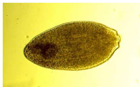
Figure 2: Microscope image of Diplostomum sp. metaserker (Original).

Front part of the body is leaf-shaped and the ventral part concave. The rear like a small conical shaped projecting from the posterior dorsal (Fig. 2). Usually there are a couple subsidiary organ called the lateral pull and there is no real parasite cysts.