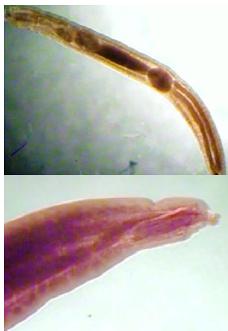
Figure 3: Microscope image of Neoechinorhynchus rutili (Original).

Body is generally bent towards the ventral, rear end thin (Fig. 3). Hose is too short and six rows with three hooks exist on it.