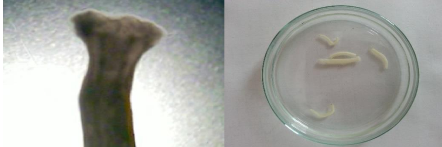
Figure 4: Microscope image of Khawia sinensis (Original).

are many and extending to the cirrus sac from back of skolex. Ovary 'H' shaped and puckered between the uterus and ovary cirrus sac (Fig. 4).