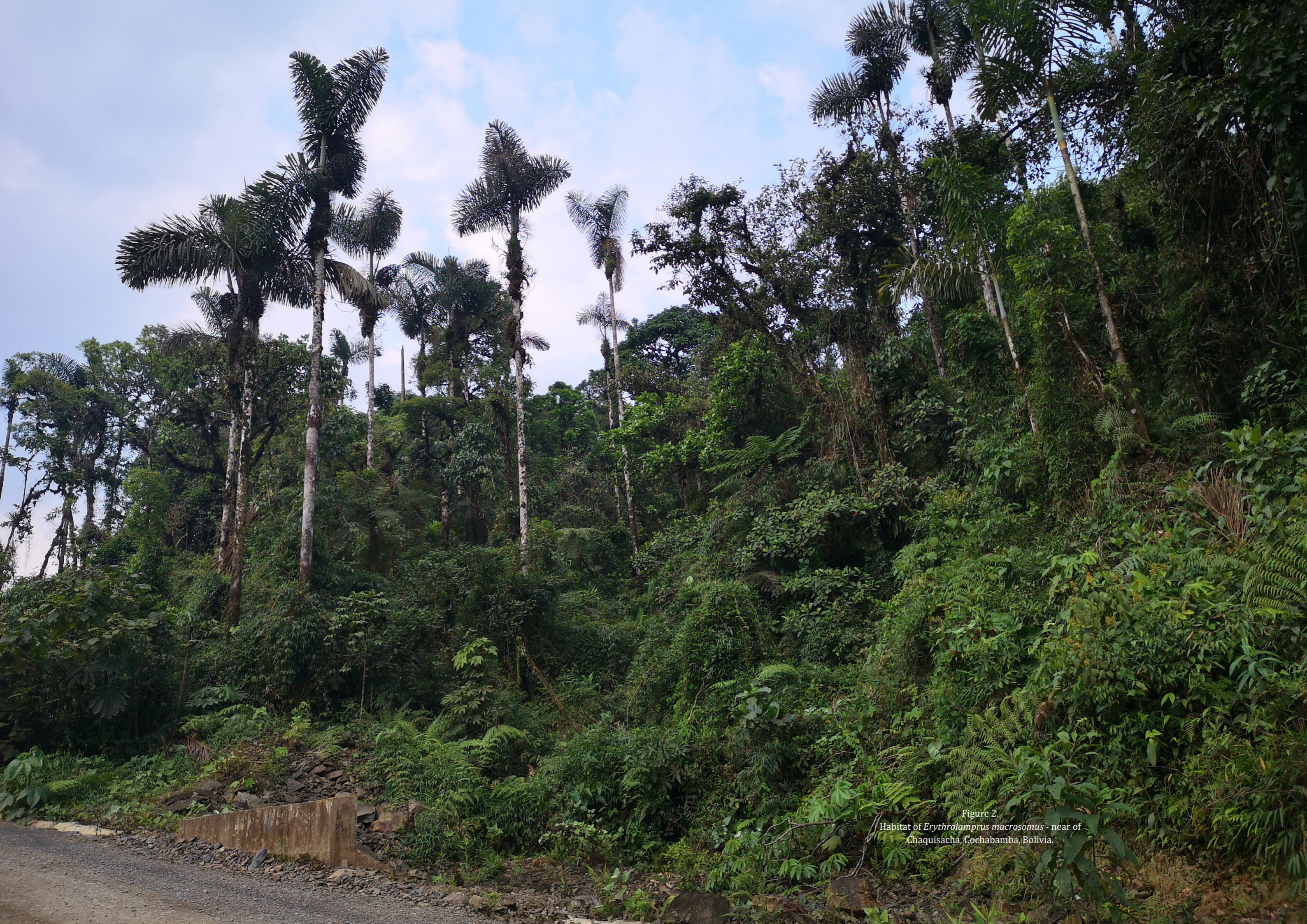
Figure 2. Habitat of Erythrolamprus macrosomus - near of Chaquisacha, Cochabamba, Bolivia.