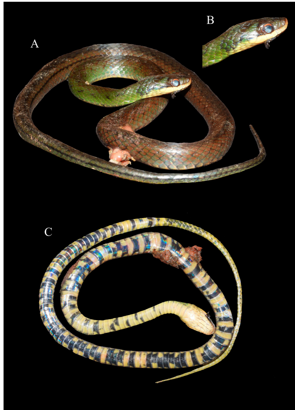
Figure 1. The collected specimen of Erythrolamprus macrosomus at the locality of Chaquisacha, Cochabamba, Bolivia (MHNC-R 3144). (A) General view; (B) Lateral view of head; (C) Ventral view of body.

Received on 6 January 2022 / Accepted on 30 May 2022 / Published on 14 November 2022 Research Article