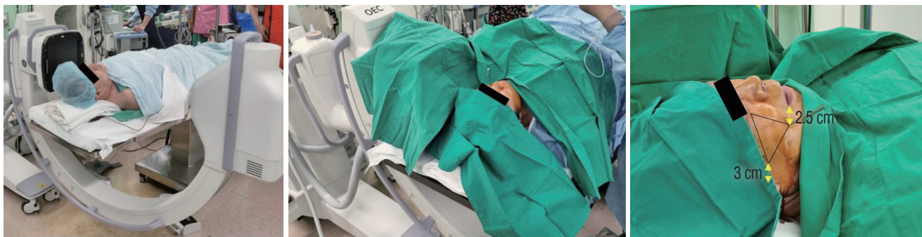
Fig. 1. Patient preparation and Hartel's method landmarks. Hartel's anatomic landmarks were drawn on the ipsilateral face of the patient, inferior to the medial pupil, 3 cm anterior to the external auditory meatus, and 2.5 cm lateral to the lips.