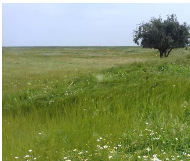
Fig. 1 Chamomile collection area in Dehloran city

in the headspace of the solid surface. The SPME syringe with a lid on it was then placed in the headspace of the container and the material in the vapor was absorbed by the silica phase in the instrument needle. After the silica fiber was allowed to sufficiently saturate with volatile components, the fiber was directly placed into the GC/MS input section and materials present in the fiber were absorbed due to the temperature of the input and then entered into the GC/MS apparatus for identification [16].