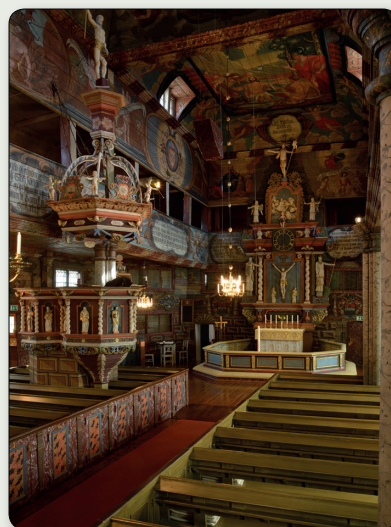
Habo Church with its rich interior paintings.