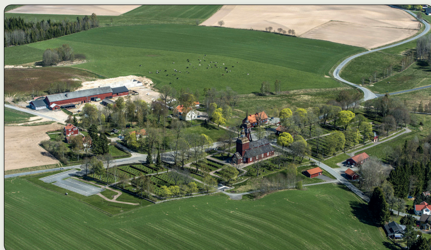
The church village Habo is surrounded by a rolling cultivated landscape.

Coordinates: N 6416373 / E 441940 (SWEREF 99 TM) // N 57° 53' 7.47", E 14° 1' 15.05" (WGS84)