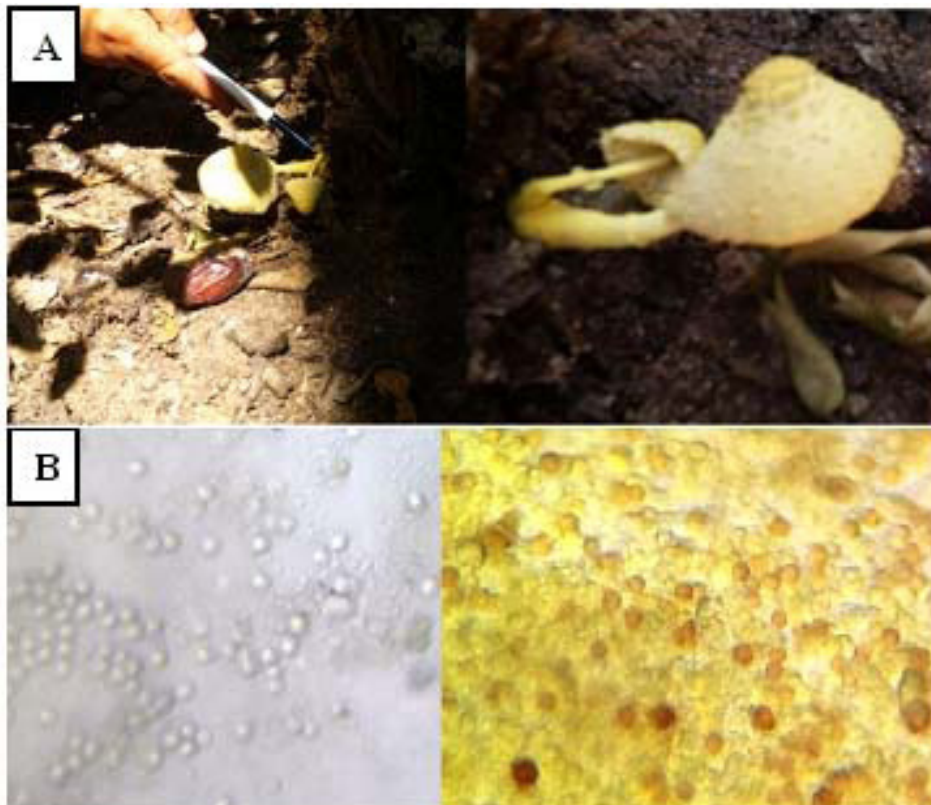
Fig. 2. Morphology of Egyptian Leucocoprinus birnbaumii fruiting bodies; (A) Canary-yellow colored agaric-mushroom with a bell-shaped cap and concolorous stipe growing on dead lemon tree trunk, (B) Light microscopy field showing colorless ellipsoid basidiospores on left and brown colored with Melzer reagent on right.