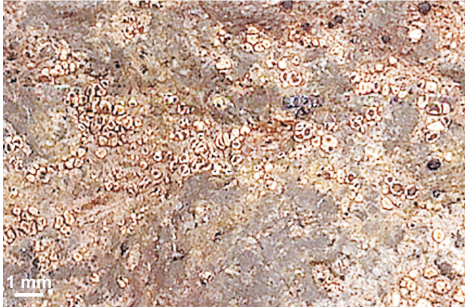
Fig. 2. Lecanora dispersa (Pers.) Sommef.

ened; discs pale greenish-gray, brownish or blackish, bare. Apothecial anatomy: amphithecium variable in thickness and abundance of algae; cortex not well delimited, varying in thickness, cellular, more or less densely filled with granules (K insoluble, N soluble); epithecium granulose, granules very fine, in a gelatinous matrix (K insoluble, N insoluble), the same granules interspersed between paraphyses tips or throughout the hymenium; epihymenium brownish or olive; hymenium 50 \mu\text{m} ; hypothecium variable in thickness, sometimes with adglutinated hyphae or almost cellular; paraphyses thin, septate, branched and transversely connected; spores 8–12 \times 5–6 \mu\text{m} . Spot test reactions: thallus and apothecial margin K –, C –, P – or parts of apothecial margin P+ orange (due to traces of pannarin, which are often undetectable by TLC); UV –. No lichen substances detected by TLC. Reported: xanthonenes and +/- pannarin (Poelt and Leuckert 1995). Fig. 2.