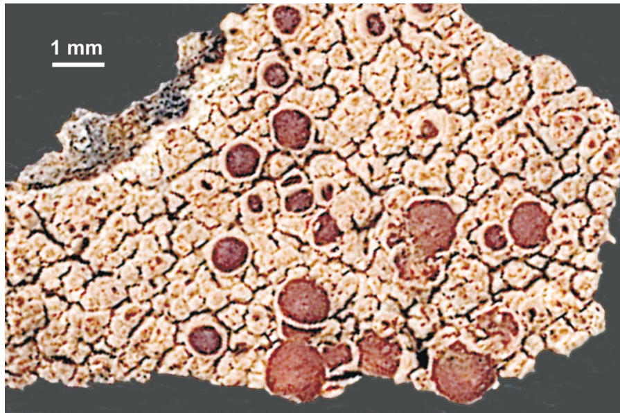
Fig. 1. Lecanora dancoensis Vain.

120–140 \mu\text{m} thick, with abundant algae, very dense in structure; cortex very thin, uniform (row of cells?); epihymenium brown; hymenium 60–80 (120) \mu\text{m} ; hypothecium ca. 160 \mu\text{m} ; paraphyses thin, simple; spores 15.0–17.0 \times 7.5–9.5 \mu\text{m} . Spot test reactions : thallus and apothecial margin K + yellow, C –, P + orange; UV –. Stictic acid detected by TLC. Conidia ca. 3.5 \mu\text{m} . Fig. 1.