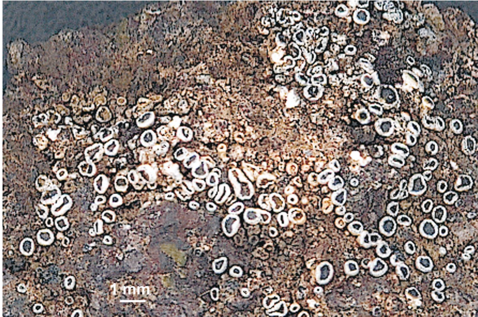
Fig. 4. Lecanora sverdrupiana Øvst.

Specimen examined. — King George Island, Admiralty Bay region. Ezcurra Inlet: Kasprowy Hill, WN, alt. 5 m, on stone, 29 July 1987, M.A. Olech, s.n. (KRA-L).