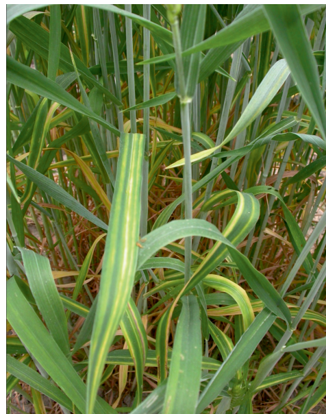
Fig. 1. Stripes caused by Cephalosporium gramineum on winter wheat leaves

In 2016 after harvesting of the crop, the soil was sampled to determine the content of SOM and soil pH. Soil samples (five per plot) were taken between stubble rows from the plough layer (0–25 cm) using a soil corer (30 mm internal diameter). Field moist soil samples were passed through a sieve with 2 mm openings, air dried and stored at room temperature. Determinations of: C org. (PN-ISO 14235 – Soil Quality – Determination of organic carbon by sulfochromic oxidation) and soil pH [potentiometrically in 1 : 2.5 suspension of soil in 1 M KCl (ISO 10390 – Soil