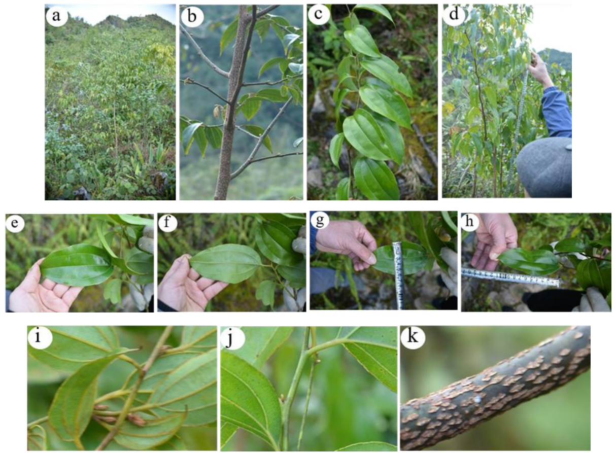
Figure 1: Phjac chac's morphological characteristics

Phjac chac's flowers emerge from the nodes or buds of the stem and are minutely sericeous. They are hermaphroditic and grow in clusters. Flower buds are darker shades of green. Peduncles are 0.3 - 0.4 cm in length and green in color (data not shown). Its pollination process of Phjac chac is facilitated by insects. As the flowers are fertilized and afterward developed into fruits. The fruits are oval-shaped or round and are eaten by birds which subsequently distribute in the dispersal of their seeds.