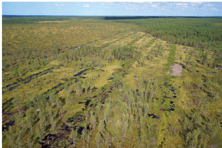
Restored Kauhaneva from air.