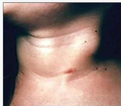
Figure 1: Cervical polyadenopaties bilateral internal jugular and posterior lymph chains.

intermittent gastro-esophageal reflux, he quit smoking about a year ago, work as a cook. He reported than the treatments, and diagnosis, doctors who consult him. So first was diagnosed with Acute catarrhal pharyngitis with adenitis and 5 days was treated with-Claritromicine SR 500mg/day, AINS, antiseptics for the throat but the lymph nodes continue to enlarge and more others appear day by day. He start an IV course of Ampicillin -plus sulbactam and but with the same effect. In the clinic after lab test and imagistic we decide for an excisional biopsies of the cervical lymph nodes under general anesthesia (Figure 1).