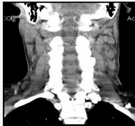
Figure 2: CT scan contrast iv- bilateral lymhadenopatya with central necrosis

That's why we decide to perform under general anesthesia an excisional biopsy of lymph node. Histopathological exam and IHC established the diagnosis of KICUCHI FUJIMOTO disease showed reactive follicles, an expanded parafollicular area with clusters of large immunoblast-like cells, and histiocytes. Multiple areas showed necrotic foci with apoptotic debris but no granulocytes. Immunohistochemical staining showed CD3 positive T lymphocytes and CD20 positive B lymphocytes within the par cortical areas.