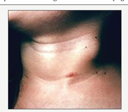
Figure 1: Cervical polyadenopaties bilateral internal jugular and posterior lymph chains.

intermittent gastro-esophageal reflux, he quit smoking about a year ago, work as a cook. He reported than the treatments, and diagnosis, doctors who consult him. So first was diagnosed with Acute catarrhal pharyngitis with adenitis and 5 days was treated with-Claritromicine SR 500mg/day, AINS, antiseptics for the throat but the lymph nodes continue to enlarge and more others appear day by day. He start an IV course of Ampicillin-plus sulbactam and but with the same effect. In the clinic after lab test and imagistic we decide for an excisional biopsies of the cervical lymph nodes under general anesthesia (Figure 1).