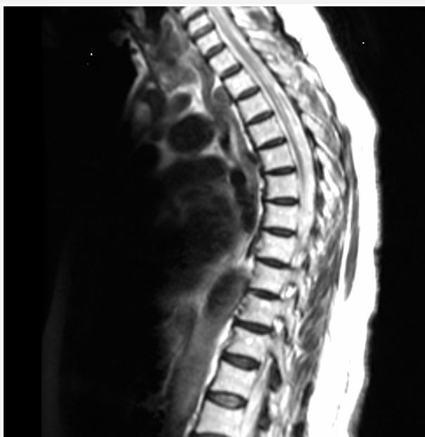
Figure 1: MRI of the thoracic spine indicated prominent Cerebro Spinal Fluid (CSF) density from T1 to T4 with no evidence of cord mass or tumor and CT of the right leg showed mild edema.

82 year old African American female presented to the Emergency room (ER) with complaints of right lower extremity weakness and swelling for two weeks. She states the episode started suddenly as she left her physician's office after treatment for an infection in the bladder. She denies any trauma or fall, and states that there were no accompanying signs or symptoms like short