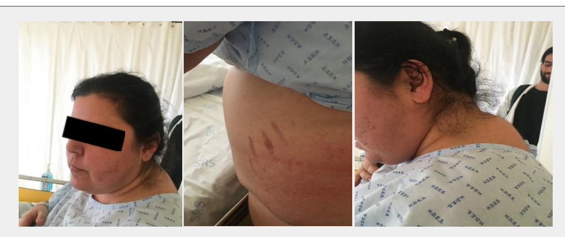
Figure 1- Phenotype of the patient in September 2019.

for left lobectomy and isthmectomy for adenomatoid goiter and obesity. In September 2019 she presented a fifteen-kilogram weight gain, alopecia, hirsutism, violet streaks, secondary amenorrhea with about 6 months of evolution (Figure 1).