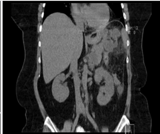
Figure 2- Abdominal control CT realized in February 2020.

Subsequent imaging tests were suggestive of unfavorable progression, especially at the expense of the increased number of secondary deposits in the lung parenchyma. The patient was referred to the Medical Oncology consultation, starting mitotane for palliation with a slow and progressive dose increase.