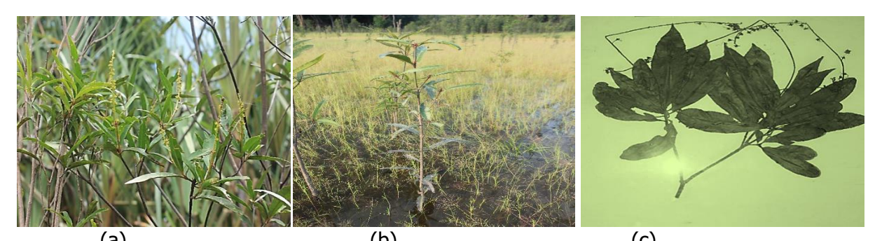
(a) (b) (c) Figure 2. The dominant vegetation of dwarf swamp forest in the LSNP area; (a) Croton cf. ensifolius , (b) Ixora mentangis , (c) Barringtonia acutangula