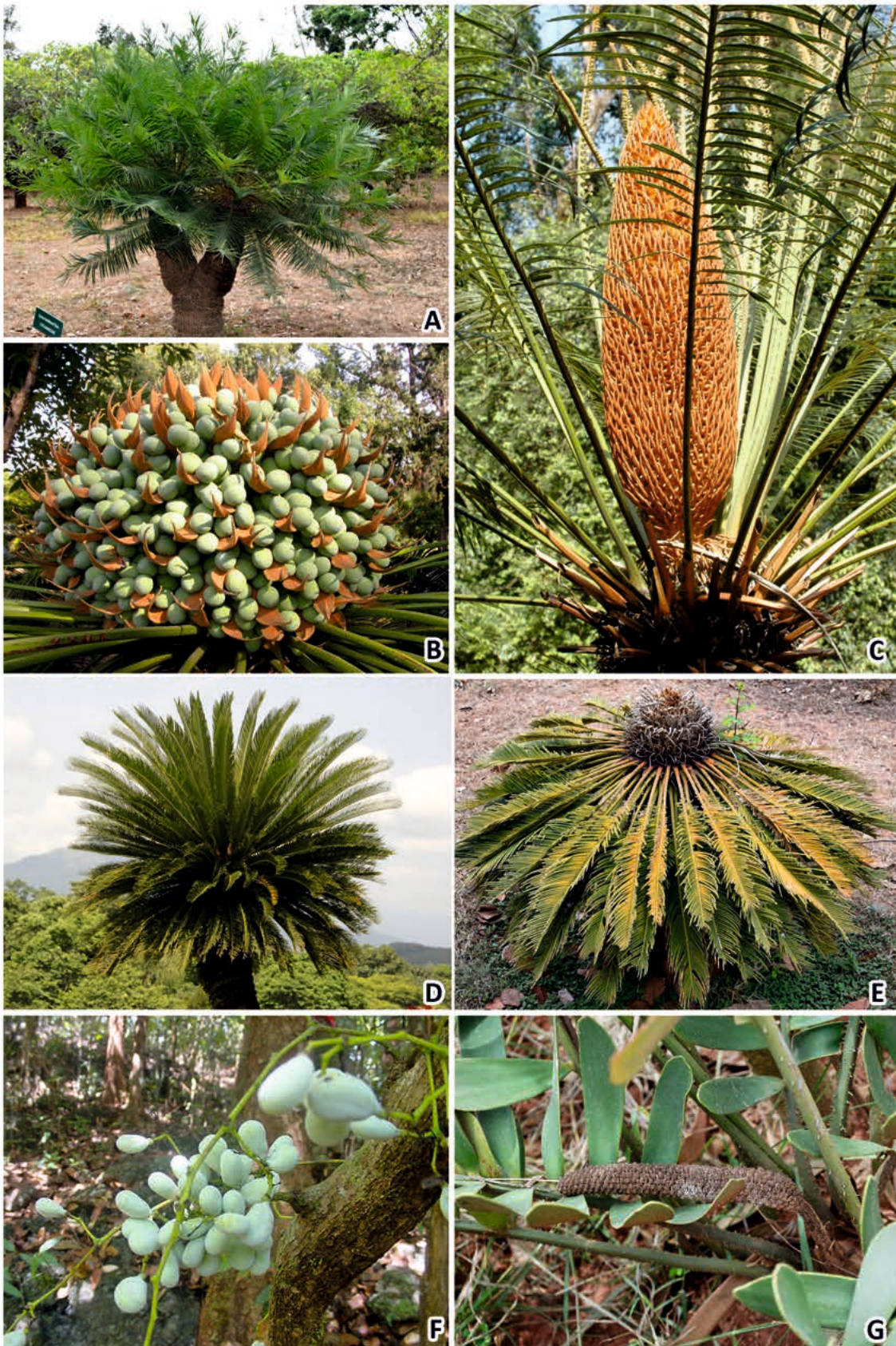
Plate 1: A. Cycas circinalis L.; B. Cycas circinalis L. - Female cone; C. Cycas circinalis L. - Male cone; D. Cycas revoluta Thunb.; E. Cycas revoluta Thunb. - Female cone; F. Gnetum ula Brongn.; G. Zamia furfuracea L.f. ex Aiton