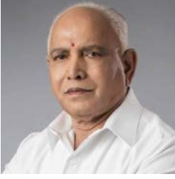
B.S. YEDIYURAPPA CHIEF MINISTER